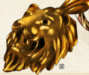
MEDALLION OF METTLE