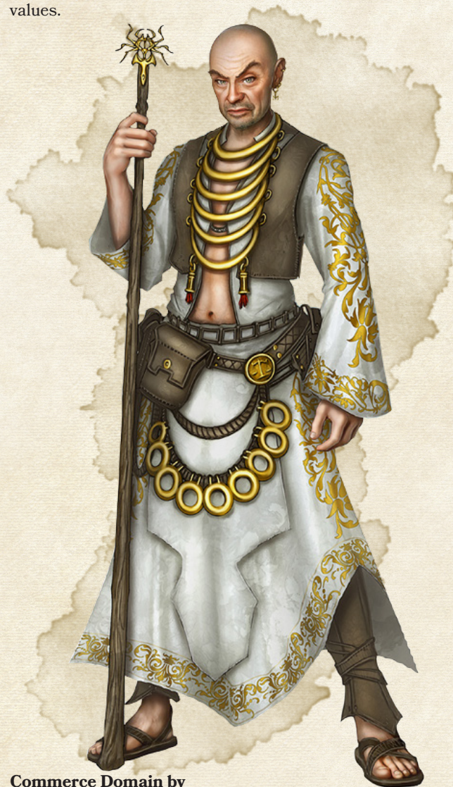
Commerce Domain by /u/coolgamertagbro

At 17th level, your invisible pull over the market is now strong enough that you can purchase goods and services at half price, replacing your 25% discount. In addition, you can use your Impart Value feature to create one object that provides a +2 to attack rolls if it is a weapon, +2 to armor class if it is a shield or armor, and +4 bonus if the item is used in conjunction with a skill or tool skill or you can empower half your Wisdom modifier (round up) in objects at the original bonus values.