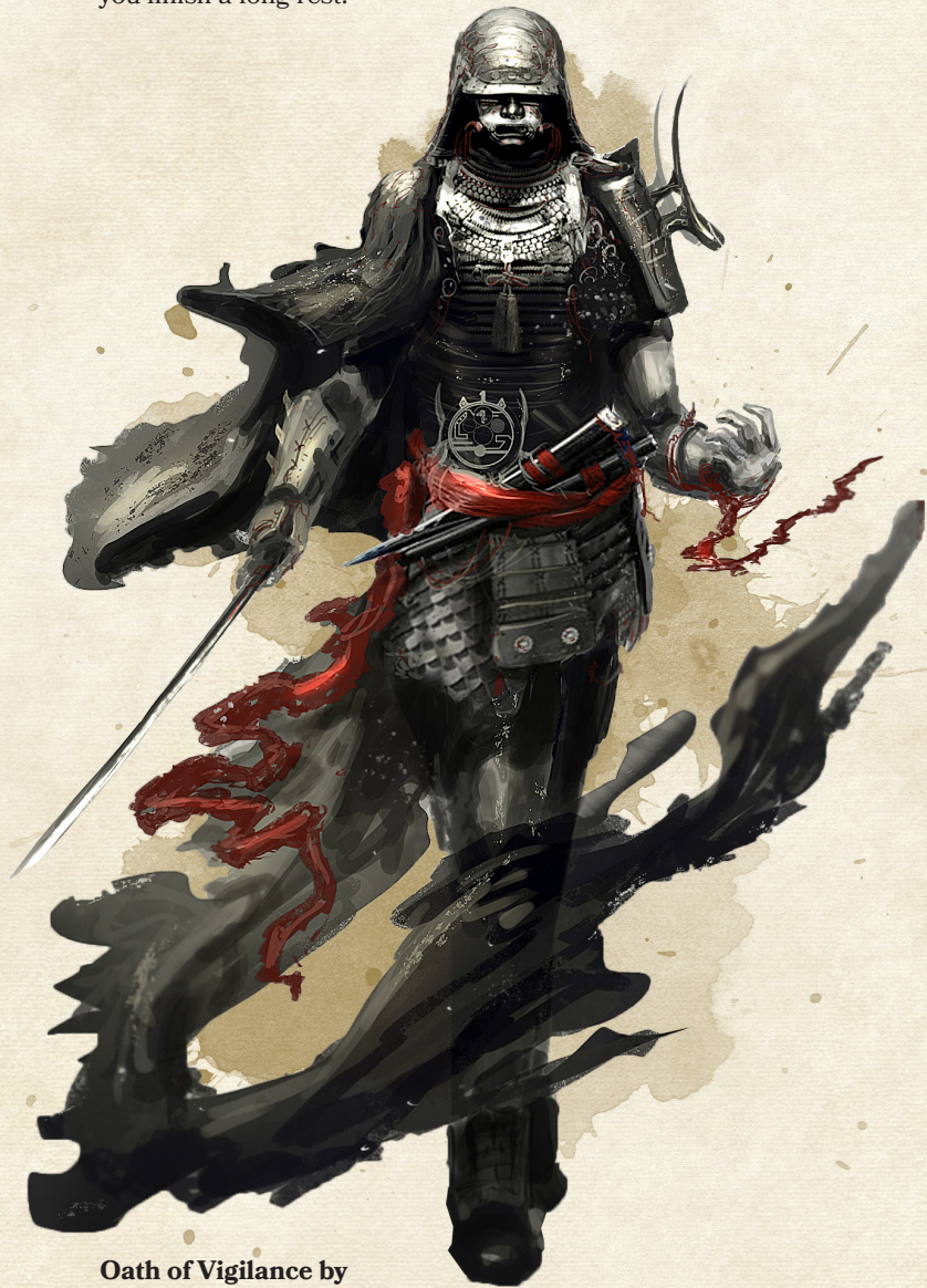
Oath of Vigilance by /u/coolgamertagbro

Once you use this feature, you can't use it again until you finish a long rest.