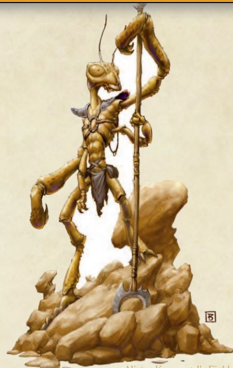
Alister Konezege's Field Guide Vol. I

Chit'al also possessed the most pronounced psionic powers of the Ptekwe tribe, capable of stunning creatures or bending adversaries to her will. It was unclear to me whether the title of shepard was one that was bestowed upon her due to her innate psionic abilities, or if her title within the group allowed her to draw on and channel the psychic energy of her clutch-mates. Regardless, I am grateful for Chit'al's wisdom and traveling with the Ptekwe tribe was one of the most eye-opening experiences of my above-water adventures.