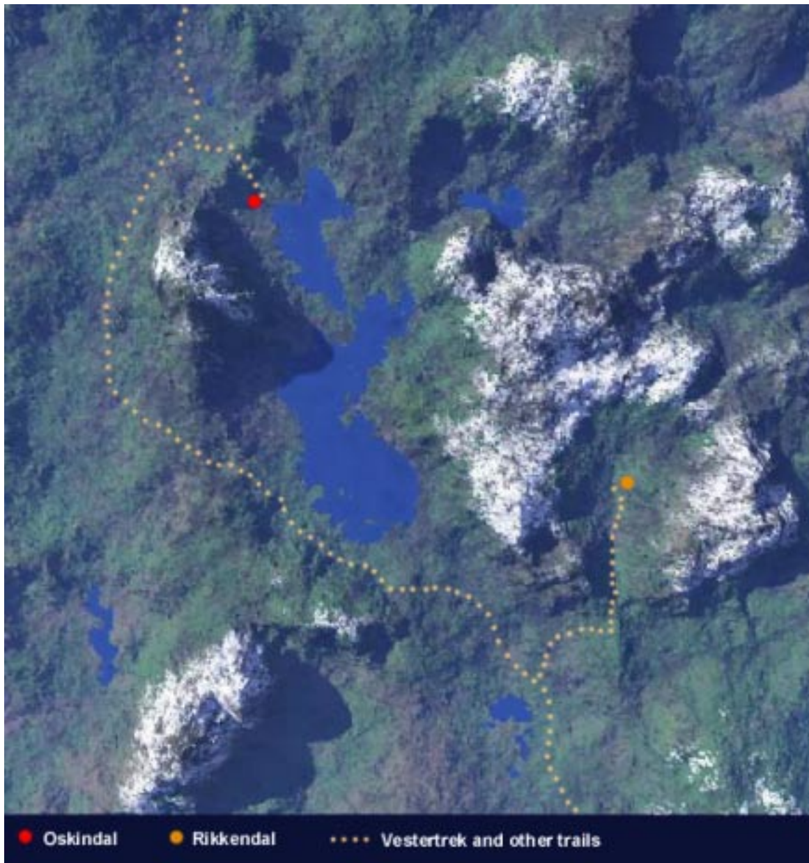
Map of the Oskindal-Rikkendal Region