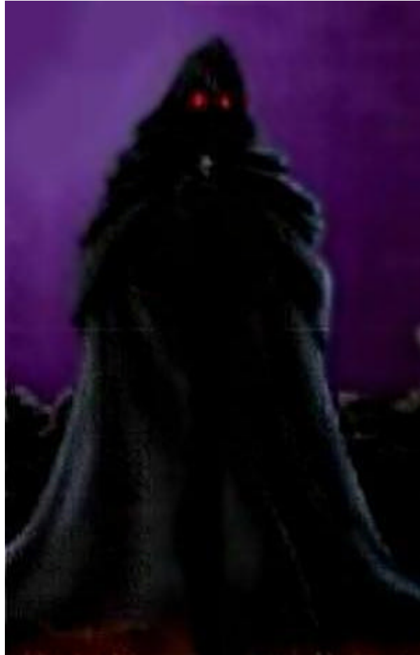
(The mysterious Voodracoor...)

The Voodracoor belong to the least known tanar'ri, as they are extremely rare. In fact, it is very, very bad luck if one ever meets one (and especially a group) of these horrible fiends.