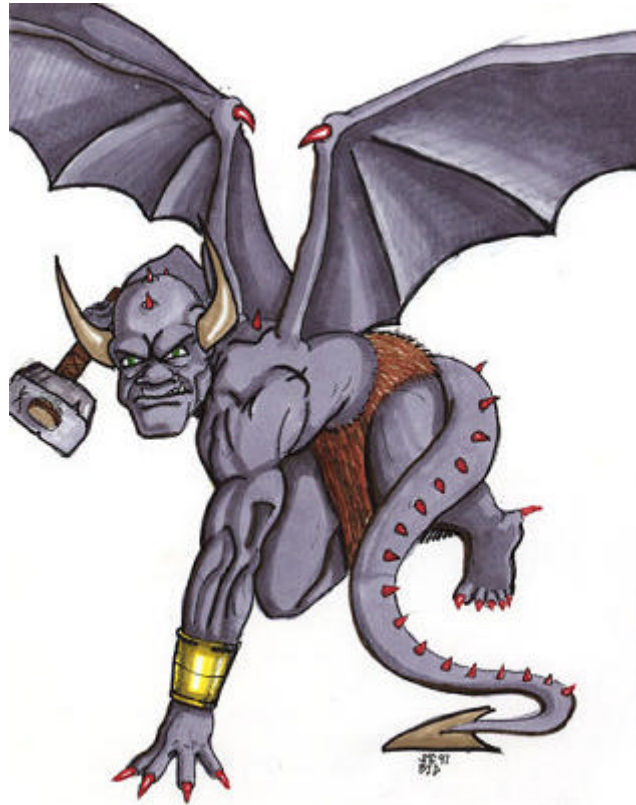
(A Ba-Rykui, embarking upon the hunt...)

Combat: The Ba-Rykui is an ambush hunter. They are well aware of the fact that they are on one of the bottom rungs of the Lower planar ladder of power and