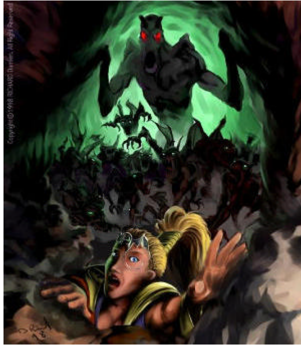
(A horde of law eaters attacking...)

Law Eaters usually share two other things with