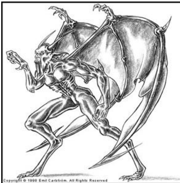
(A Zon'de, seeking goodness to consume!)

Combat: Such is the evil that the Zon'de radiates that everyone within 20 feet of it must make a succesful saving throw versus Spell. Those of neutral or evil alignment that fail this save immediately attack any good creatures around.