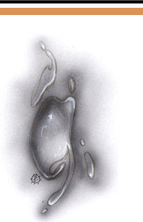
(Alien and deadly, the Iaiwi Drone!)

Habitat/Society: Almost nothing is known about the social structure of Iaiwi. They tend to arrive in small, isolated settlements, which they quickly take over. From there on, they will infest groups of travellers with a spare Keeper or two and some Drones.