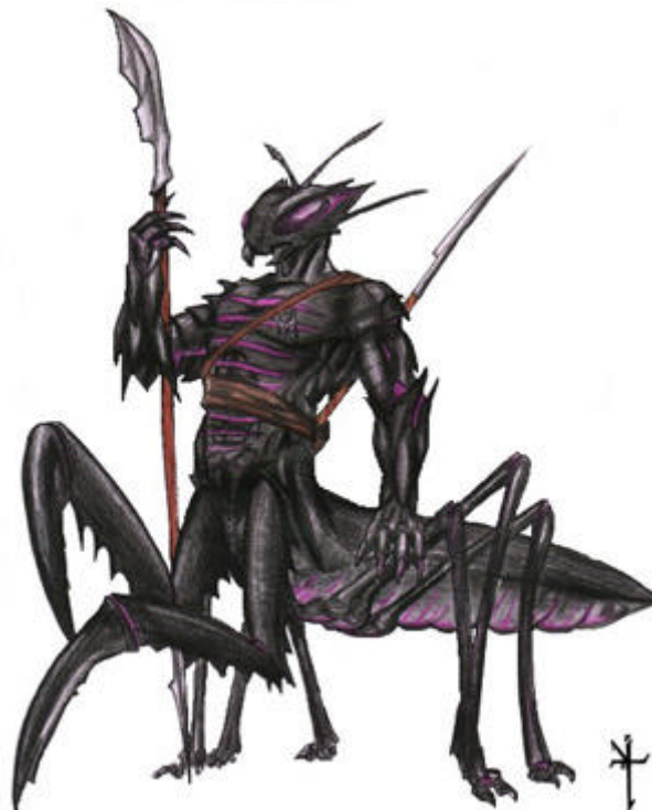
(The Fearsome Hunter, Jehorra)

The large compound eyes set of the sides of the head give 320 degree vision, and the antennae sense movement within 50' making it impossible to suprise a Jehorra. The enlarged jaws have a pronounced overbite and are extremely sharp. The crushing bottom arms are mantis like and stay curled by the body except when attacking.