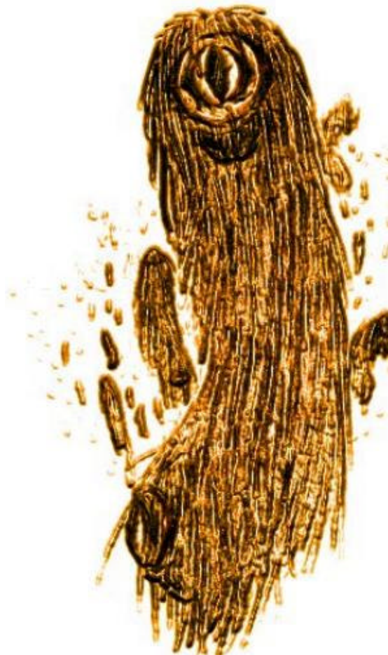
(Cat Hair harmless? Not likely!)

Combat: The initial attack of the cat hair falls into two major categories and both are often used