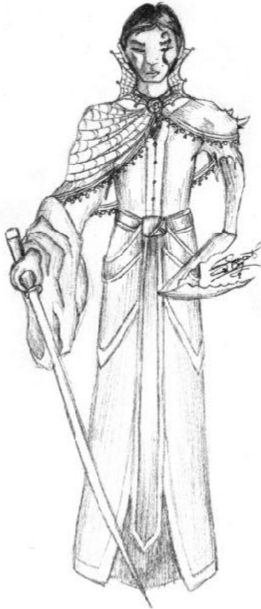
(A Loather, twisted by his own inner evil)

This introduction to the Tome of the Loather was the first sign ever the Fraternity of Order found about the beings called Loathers. It took decades until the countless fragments of the Tome were unburied by faction members. It seems someone was interested in making sure the Tome would never be read by anyone; it was nothing but chance and extreme devotion of the members of our Fraternity that crossed these plans. With even more research, we also found out why that someone did not simply destroy the Tome. It turned out the book was magically protected, and even high-level magic could not permanently harm it. It always repaired itself after some time; the only way to "destroy" it was to scatter its