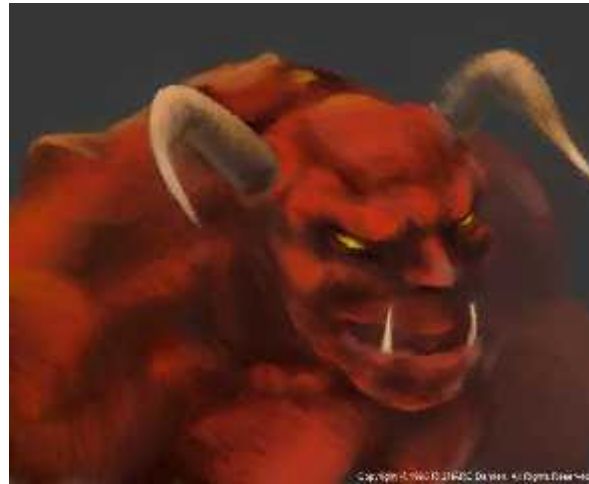
(A Barzu, thinking impure thoughts...)

Barzu are hideous creatures with a tough hairless hide, scimitar horns, fangs, and a physiology that requires a steady diet of fresh meat as well as plants.