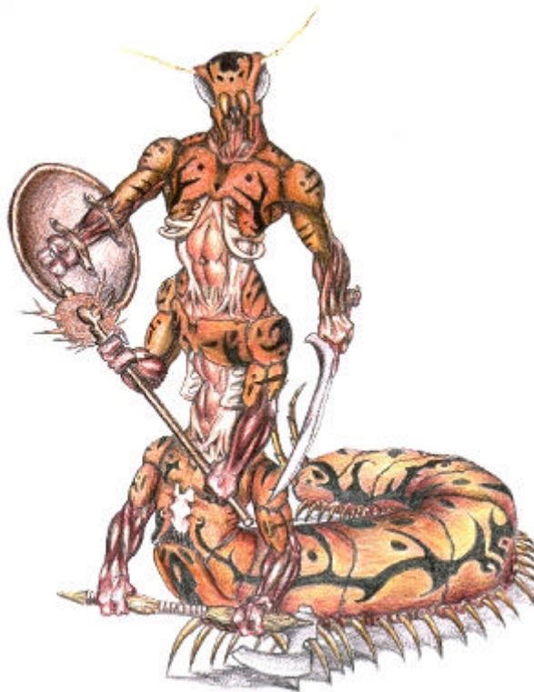
(The enforcer of the Barinith, the Centimere!)

The head is large and insect-like. It is angular with large compound eyes set to either side, and mandibles dominating the face. The whip like antennae lean slightly to the rear and are sensitive to any movement. From head to rear section they measure 25' in length and a normal specimen will weigh 4,000 lbs. The chitin-armor