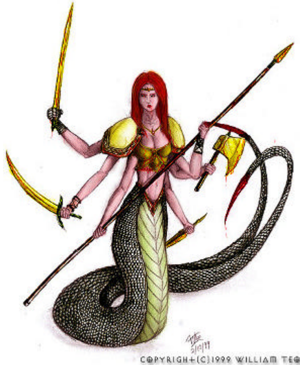
(The Brutal Echideneco)

The Echideneco are supposedly related to the Marilith tandar'ri. They look quite similar (female upper body, snake-like from the waist down, six tentacle-like arms), but are larger and more fearsome fighters. They have two tails, each with a long sting at the end, and the mouth is filled with long, razor-sharp teeth. Their faces usually show expressions of pure hatred and bloodlust.