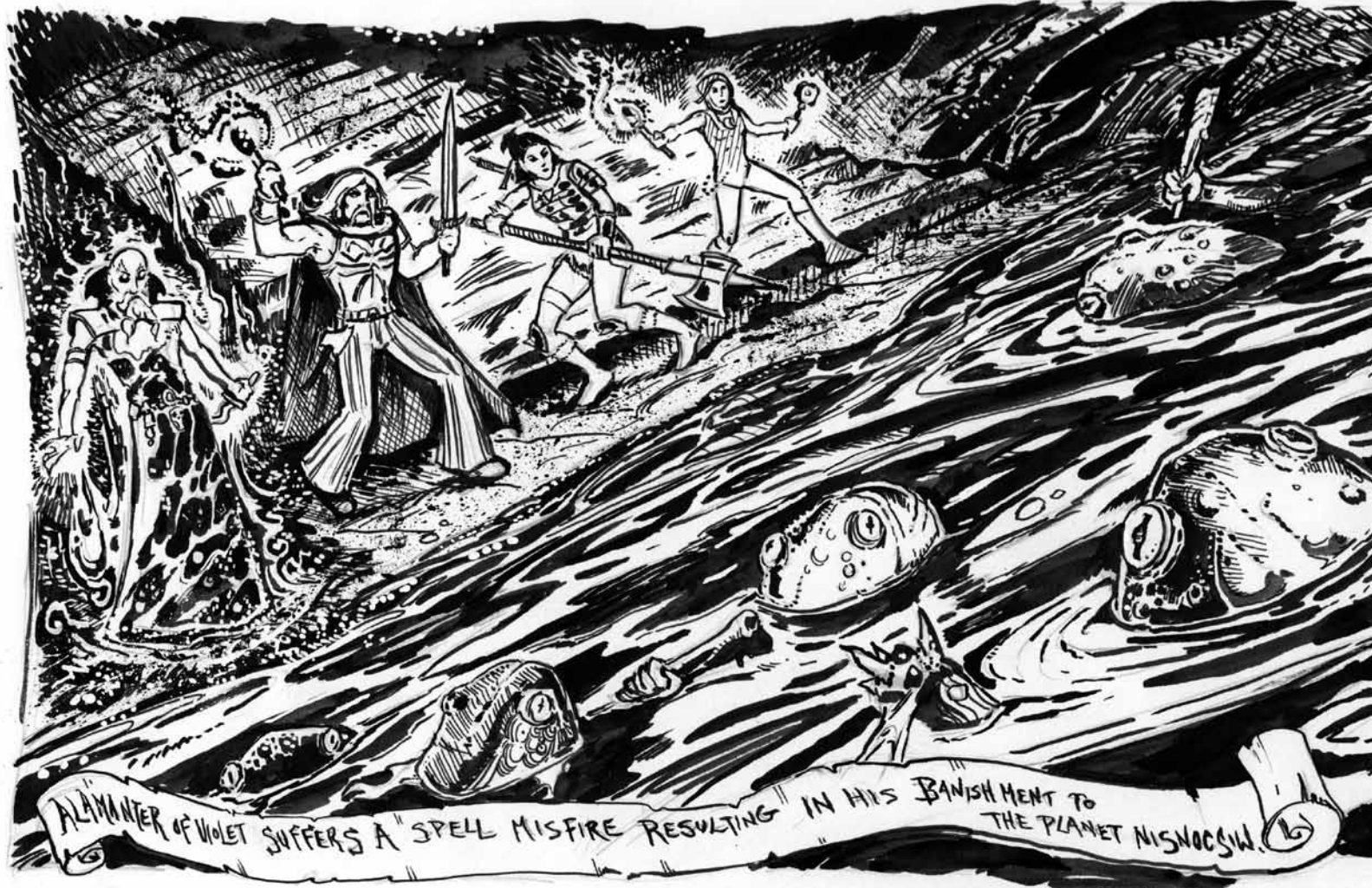
ALAMNER OF VIOLET SUFFERS A "SPELL MISFIRE" RESULTING IN HIS BANISHMENT TO THE PLANET NISNOCSW. (6)