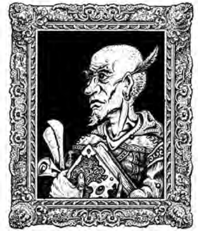
Table 1-8: Eight Underlings of the Rainbow Palace & The Citadel