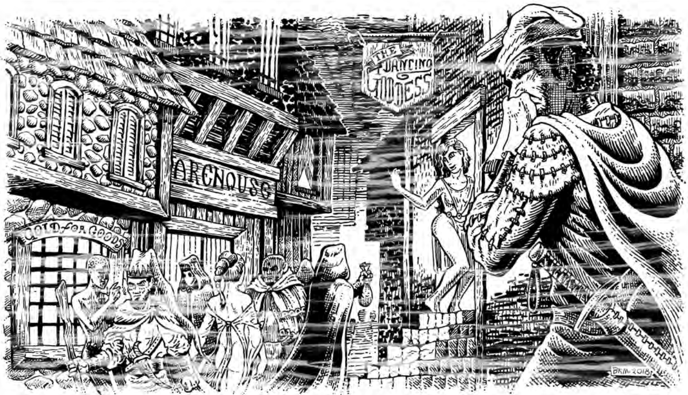
Table 1-1: Random Lankhmar Building (Roll 3d6)