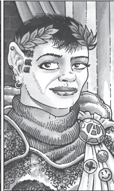
SHALEA "SUNBURN" STEELWAGON

This printing of Dungeonbattle Brooklyn is done under version 1.0 of the Open Gaming License, and the System Reference Document by permission from Wizards of the Coast, Inc. Designation of Product Identity: The following items are hereby designated as Product Identity in accordance with Section 1(e) of the Open Game License, version 1.0: Dungeon Crawl Classics, DCC RPG, Mighty Deed of Arms, spell check, Luck check, spellburn, mercurial magic, corruption, disapproval, all spell names, all proper nouns, capitalized terms, italicized terms, artwork, maps, symbols, depictions, and illustrations, except such elements that already appear in the System Reference Document.