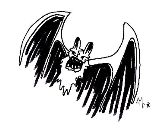
Area B - The Liminal Vestibule

Morgon's Beacon: A glowing emerald the size of a halfling's head, Morgon's Beacon glistens with an oily secretion, and seems to produce its own faint light. It is worth 300 gp as a gemstone, and could be used as a light source (the glow is equivalent to that of a candle). It is however tainted with the touch of Morgon. Prolonged contact with the gemstone causes the carrier to become disgusting: their bodily secretions are increased ten-fold to normal, and eventually they become sweaty, snotty messes. The effect becomes permanent after a week of contact, and at that point it can only be removed by extensive purification rituals involving a lawful cleric.