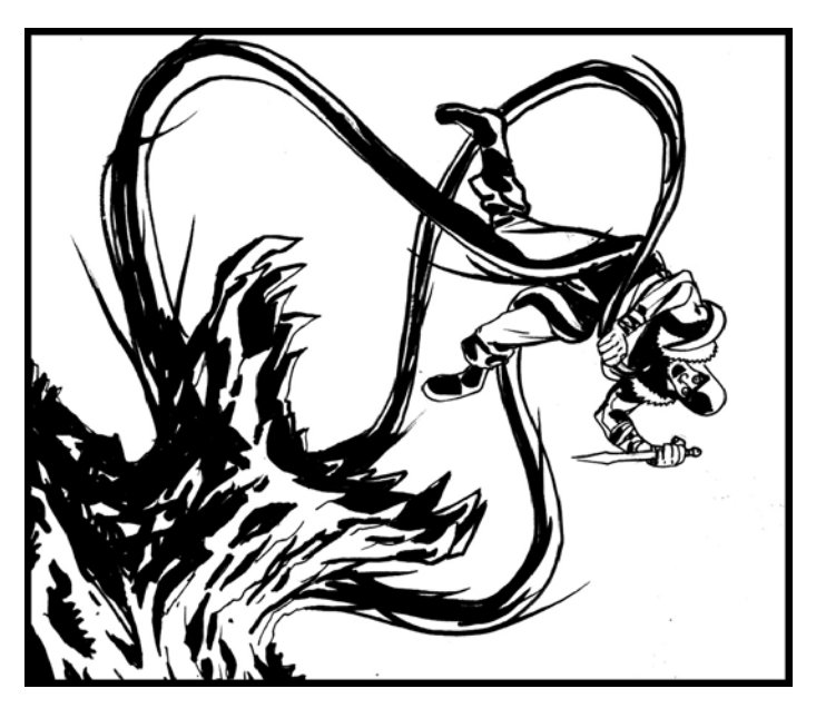
E5 - The Maneats: Here the clearing forms a semi-spherical recess into the jungle. Inside this recess are four stubby trees arranged in a vaguely square-shaped pattern. Their green surfaces are strangely wrinkled and from them snake several vine-like protrusions that disappear amidst the grass. In the center of the rough square formed by the trunks rises a pyramidal structure made of some strange crystalline material, almost translucent on the surface but growing more opaque underneath. The object is 4' tall and reflects the sunlight from certain angles.. On top of this structure there is a fist-sized red jewel emitting a glow that is noticeable even under such a bright sun.

If the players attempt to attack the monkeys they will leap into the jungle, disappearing among the trees.