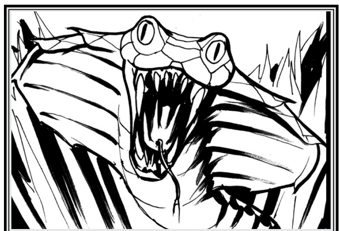
Shardian Grass Cobra (2): Init +6; Atk bite +2 melee (1d4+1); AC 12; HD 1d6+1; hp 4; MV 30'; Act 1d20; SP spit poison (DC10 Ref save or 1d4 dmg); SV Fort -2, Ref +4, Will 0; AL C.

Although most local fauna will try to avoid the party, the Shardian Grass Cobras that flourish here are another mater entirely. Corrupted by overexposure to elemental artifacts, these creatures are extremely aggressive and will attack as soon as they feel threatened. Roll for initiative (and follow the initiative order as the combat begins) the player with the lower score will be the one to unwittingly trip on 2 of these creatures. They will promptly raise their heads above the grass, flashing their brightly colored hoods before attacking the party (not necessarily the player who rolled lower because the snakes will attack in whatever direction they are facing). They fight in a standing position, being treated as normal enemies even in the grass.