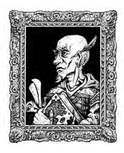
Table 1-8: Eight Underlings of the Rainbow Palace & The Citadel