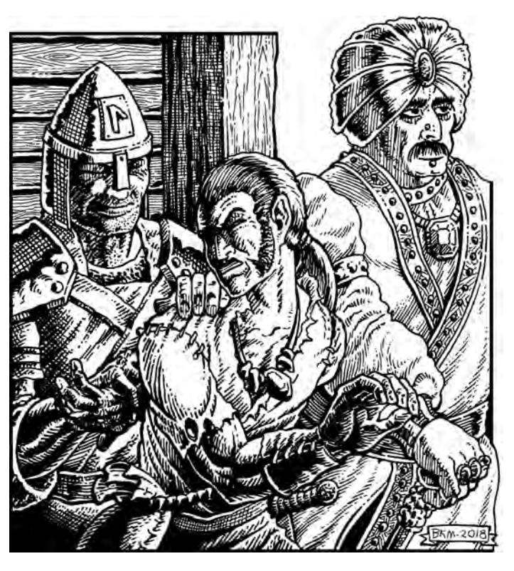
Table 1-9: Interesting Events in the Noble Quarter

The judge in need of a spur-of-the-moment member of the noble class can roll 1d12 five times on table 1-10, once per column, to swiftly create a noble employer, foil, or outright adversary for the PCs.