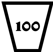
Max Hit Points