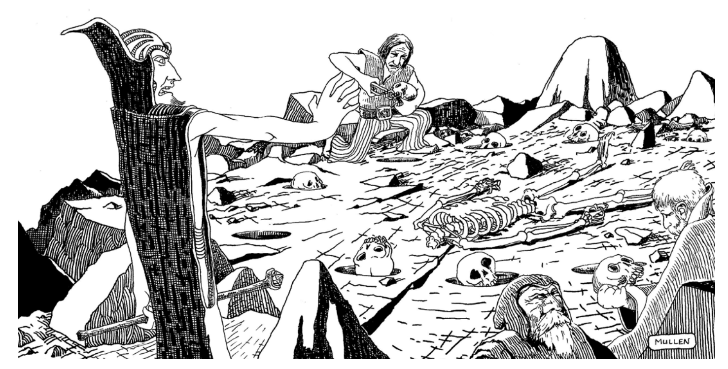
Area 1-4A – The Revivification Circle: At this place in the rocky cavern floor, there is a disturbing arrangement of bones. A collection of skulls has been arranged in a circle with a skeleton at its center. There are twelve skulls arrayed equidistant around the circle. No, not quite equidistant: one place is an empty slot marked by a carven depression, so there are thirteen slots and only twelve skulls. The skeleton at the center of the circle is missing its skull, and is quite clearly composed of bones from different sources; the length and shape of the various limbs don't quite match each other.

The twelve skulls each come from a Magnussen duke, as do the bones; all were harvested from the parts missing from the coffins in area 1-2. When the thirteenth skull is placed in its position, the first duke's ritual will be completed; the Silver Skull will then materialize atop the skeleton, which comes to life as the other souls are condemned to eternal hell. Wizards have a 75% chance of understanding the purpose of this arrangement.