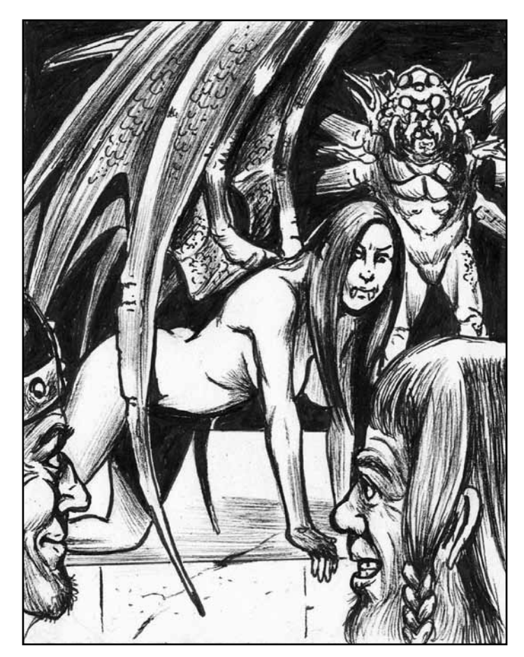
Area 1-8 -The Tomb of the Last Colossus: The passage from area 1-7 goes several hundred feet before opening into the vast Tomb of the Last Colossus.

You emerge from the small passage to stand in a vast space far larger than you can comprehend. It is a cave made of the utmost craftsmanship, extending to the limit of your eyesight. A faint light from far above illuminates the entire space. A half-mile in the distance is a massive mummy seated on a giant stone throne. Even from here it seems enormous — this is a mummy that is larger than anything you have ever seen before. As a beetle is to a man, you are to this mummy: it is hundreds or thousands of feet tall.