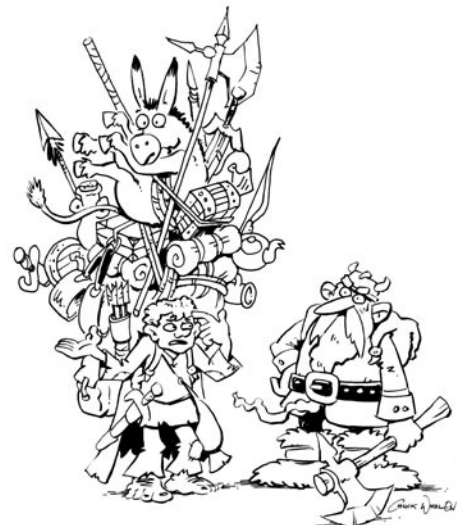
"Encumbrance? We always ignored that rule."

*** When ignited and thrown, oil causes 1d6 damage plus fire (DC 10 save vs. Reflex to put out or suffer additional 1d6 damage each round). One flask of oil burns for 6 hours in a lantern.