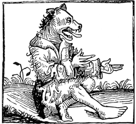
Obsessive werewolves don't really resemble wolves, but they often believe they do.

If animal-spirit possession has been established, a course of instruction under an experienced shaman can help the individual come to terms with their predisposition to possession, control spontaneous accessing of animal