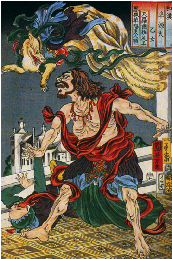
A kitsune in the form of a nine-tailed fox.

by the Yokai Jingcha (lit. “spirit police”), Japan’s major paranormal investigation and enforcement agency.