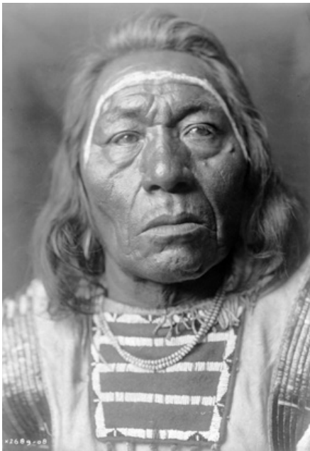
Leads the Wolf, a shaman of the Crow Nation in the late 19th century, was a famous teacher and supposedly trained an entire generation of shamanic werewolves.

Overall, the most effective technique has been old-fashioned detective work. The culprit can usually be identified by examining the behavior of the possessed wolf, determining motive, and narrowing down a range of suspects. Once this has been accomplished, the shaman can be apprehended using standard techniques and equipment such as tasers and handcuffs.