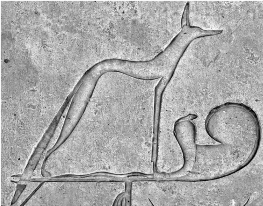
Close-up of a carved relief of Wepwawet from the Karnak Temple at Luxor, Egypt.