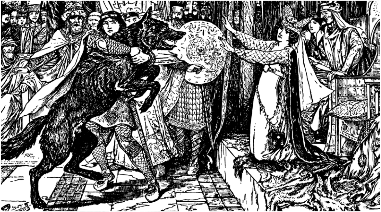
The story William of Palermo, sometimes called “William the Werewolf” is a 14th-century French romance that features a “good” cursed werewolf.