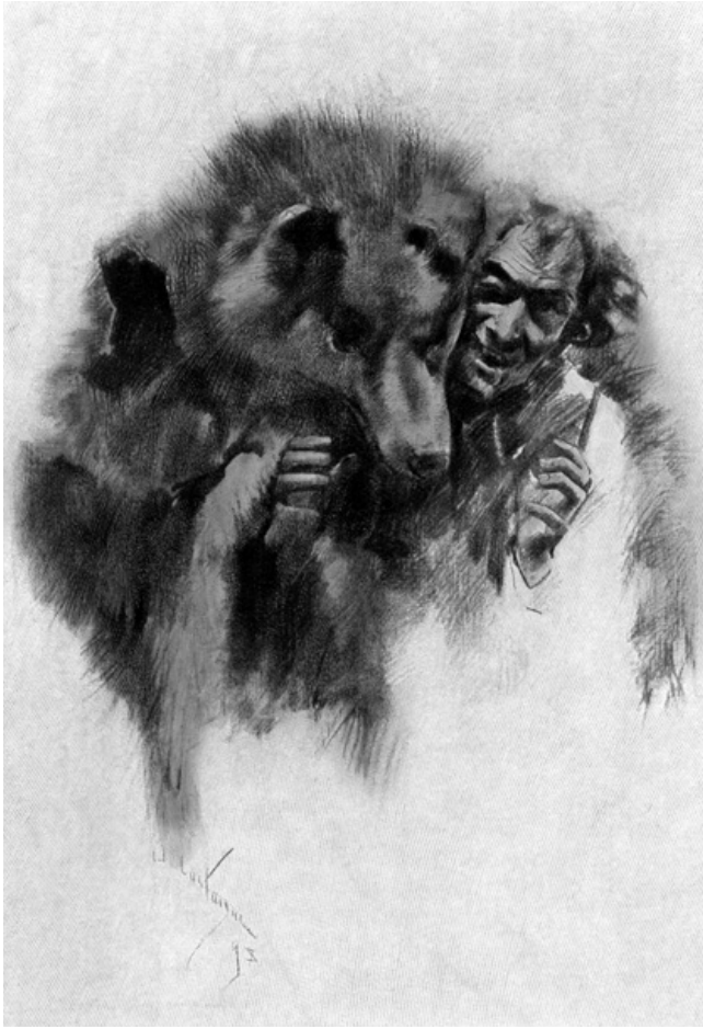
A wolf pelt is essential for a cursed werewolf to be able to transform.

If these items are discovered, they constitute conclusive proof that a case involves sorcerous lycanthropy rather than any other kind. Until that time, however, it is necessary to rely on traditional investigative techniques.