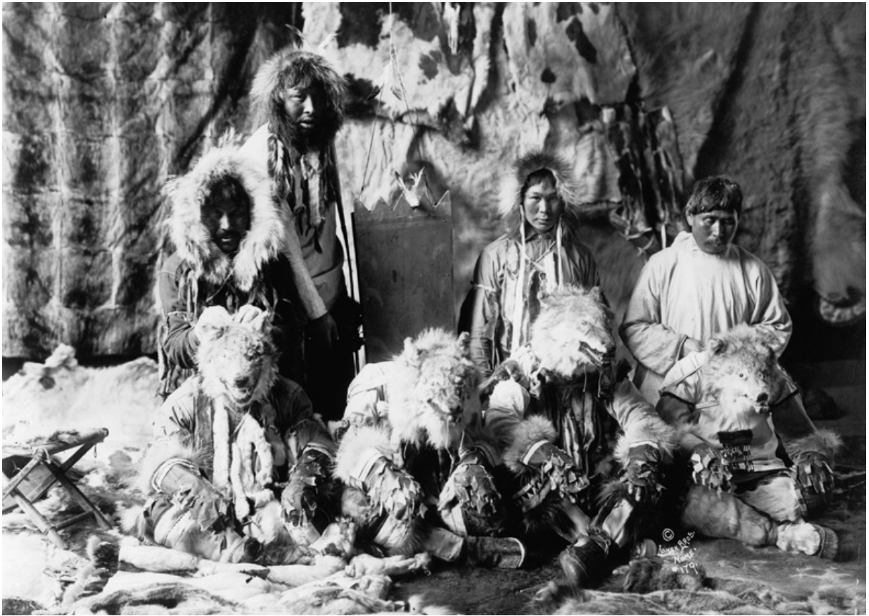
The 'Wolf Dance' of the Kaviagamutes. This Eskimo tribe was renowned for producing shamanic werewolves in the 19th century.