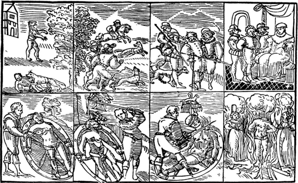
A contemporary depiction of the crimes, capture, and execution of Peter Stumpf, the 'Werewolf of Bedburg', who ran amok in 16th century Germany.