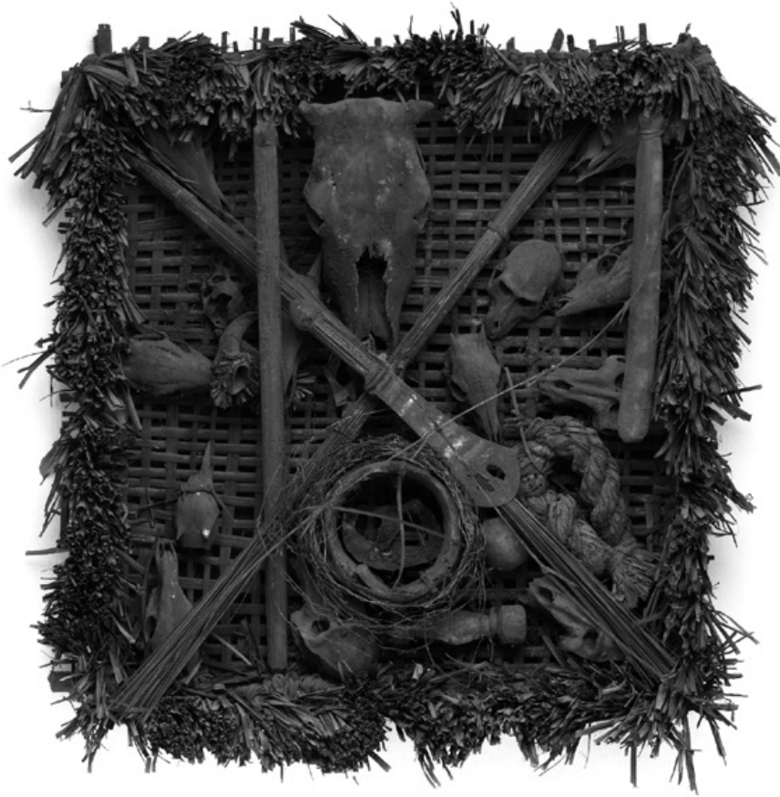
The emblem of a Leopard Society preserved in the Brooklyn Museum. (Brooklyn Museum)

controlled by spells, fasting, and meditation. When in tiger form, the harimau jadian are benign creatures who kill wild pigs to protect the community's crops. However, they can be dangerous. While in tiger form they can fail to recognize friends who do not greet them by name, often with fatal results. They have also been known to stalk and kill outsiders who wrong them or their community.