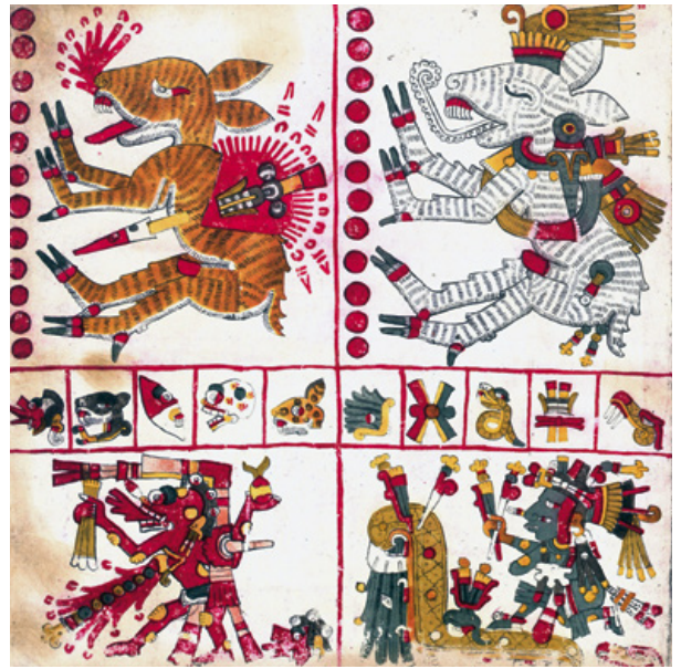
A pre-Columbian painting of a Nagual.

Buda is a form of witchcraft originating in North Africa, the Horn of Africa, and the Near East. Its powers include the evil eye (the power to injure or kill with a glance) and the ability to shapeshift into a hyena. It was first reported in 1406, in the Hawayan Al-Koubra of Al-Doumairy; French and English accounts from the 19th century broadly confirm Al-Doumairy’s account of shapeshifting witches attacking sleepers and drinking their blood. In Sudan, Tanzania, and Morocco they are also accused of digging up graves and eating the corpses, a behavior that is not unknown in natural hyenas.