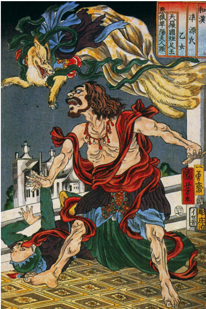
A kitsune in the form of a nine-tailed fox.

by the Yokai Jingcha (lit. “spirit police”), Japan’s major paranormal investigation and enforcement agency.