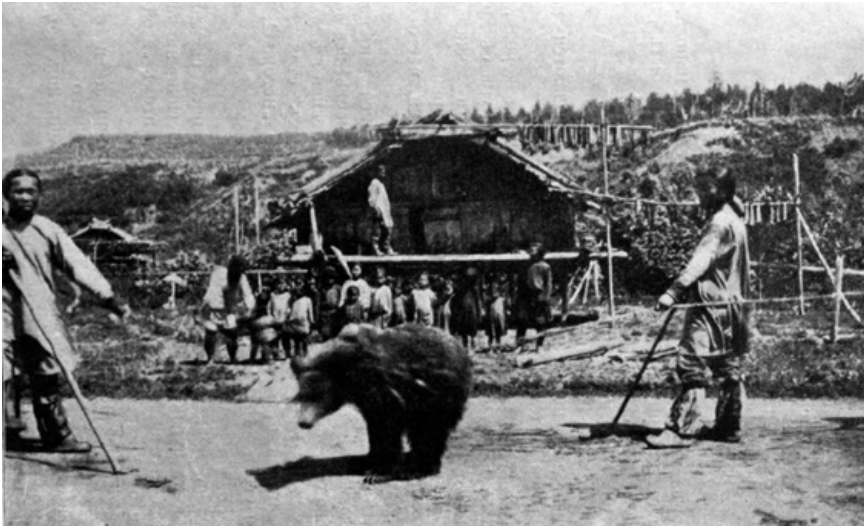
A small bear, supposedly inhabited by a Siberian shaman.

The most common threat arises when an untrained talent accidentally possesses a wolf's body and panics. This is often complicated further by the wolf's spirit trying to keep control of its body and panicking in its turn. The wolf will be unpredictable and aggressive, lashing out at anyone who comes near and sometimes even snapping at its own limbs and tail as the two spirits fight. The best defense in this situation is to keep one's distance and wait for the situation to resolve itself.