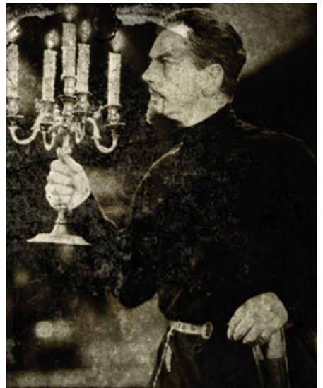
The only surviving photograph of General Mikhail Zaroff.

The equipment of a Society expedition is always the newest and the best. Thanks to the enormous wealth of many Society members, cost is never an issue. High-powered rifles with telescopic sights are the standard hunting weapon, but are backed up by machine pistols and large-caliber handguns for personal defense; equipment is almost always the property of individual members, and not of the Society. Some Society members also take great pride in their mastery of archaic and exotic hunting weapons, deeming a kill made with a primitive weapon more valuable than one made with high-tech modern equipment.