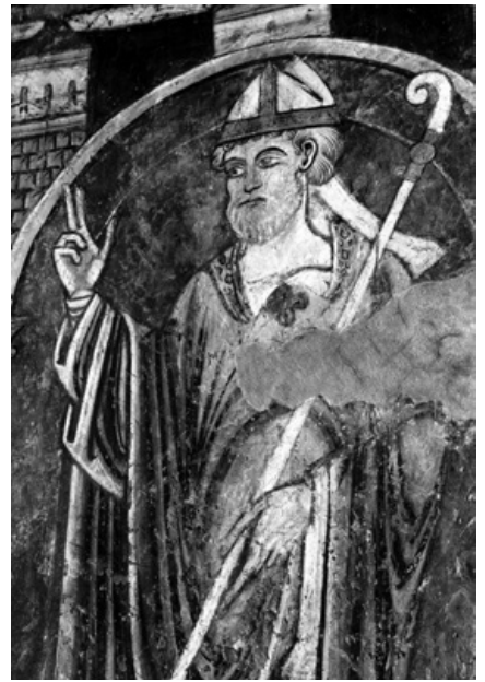
A 12th-century wall painting of St Cuthbert from Durham Cathedral.

Despite this, the Inquisition – first under its own name, and later as the Sacred Congregation of the Holy Office and the Congregation for the Doctrine of the Faith – has maintained a small but active sub-branch devoted to the investigation of lycanthropy, which is known today as the Order of St Cuthbert. It will be remembered that this early Northumbrian saint is a patron of shepherds, the wolf's natural enemy.