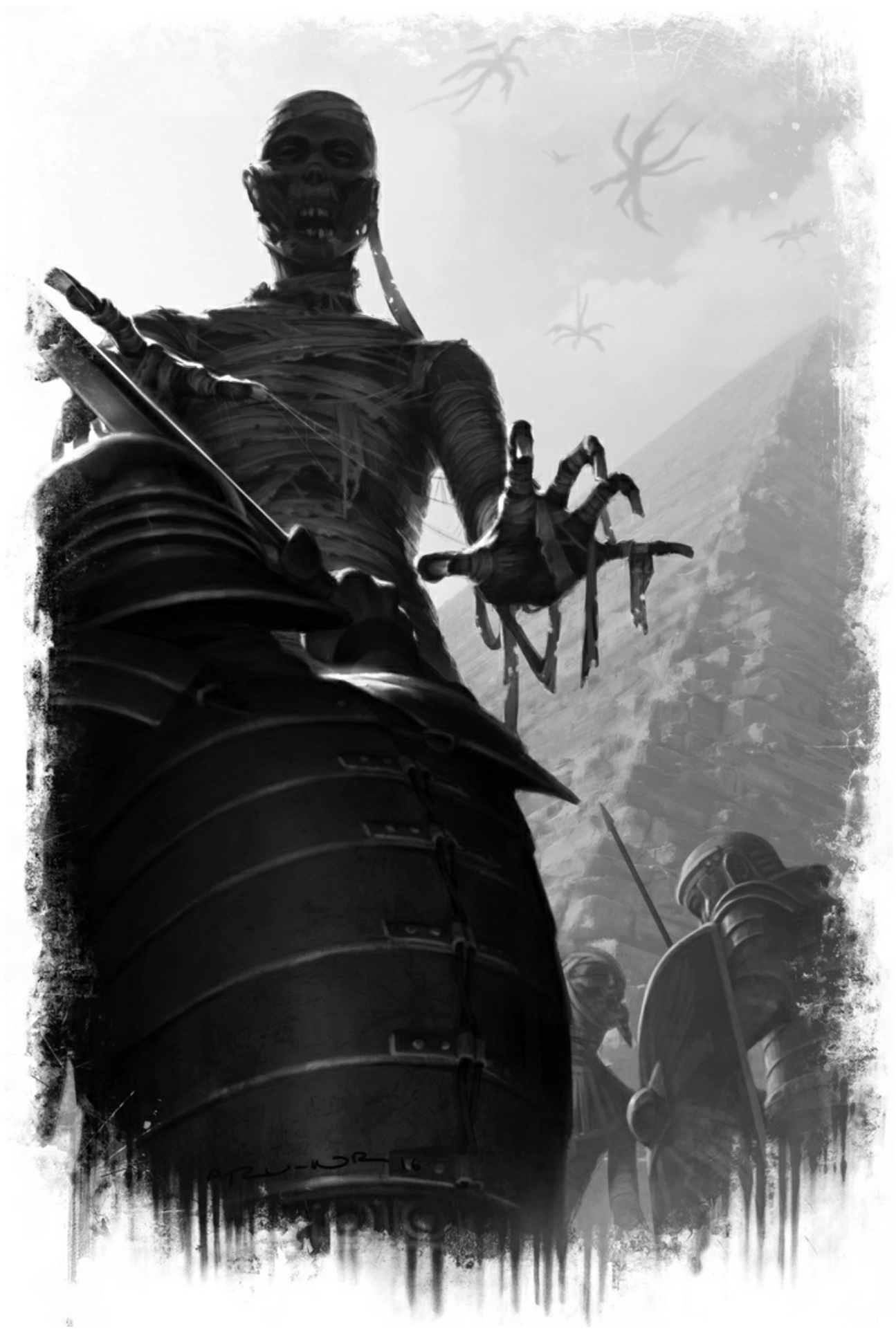
Roman soldiers battle guardians of an ancient tomb in the Valley of Kings, called Ta-sekhet-ma'at by the Egyptians.