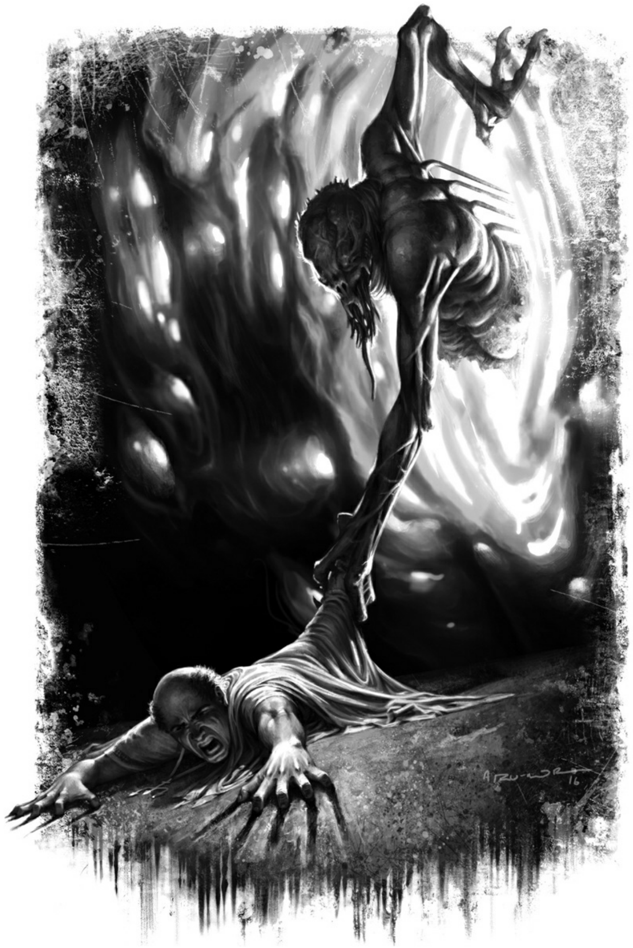
The melding of old gods and new for political purposes represented great danger for those not inducted into Cthulhu's mysteries.