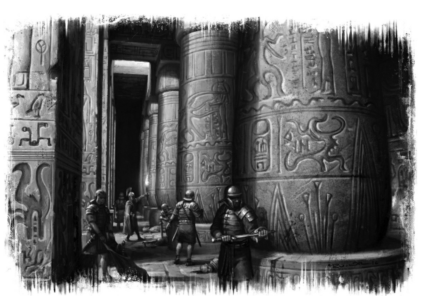
Roman legionaries sack a temple dedicated to the forbidden god Nyarlathotep.