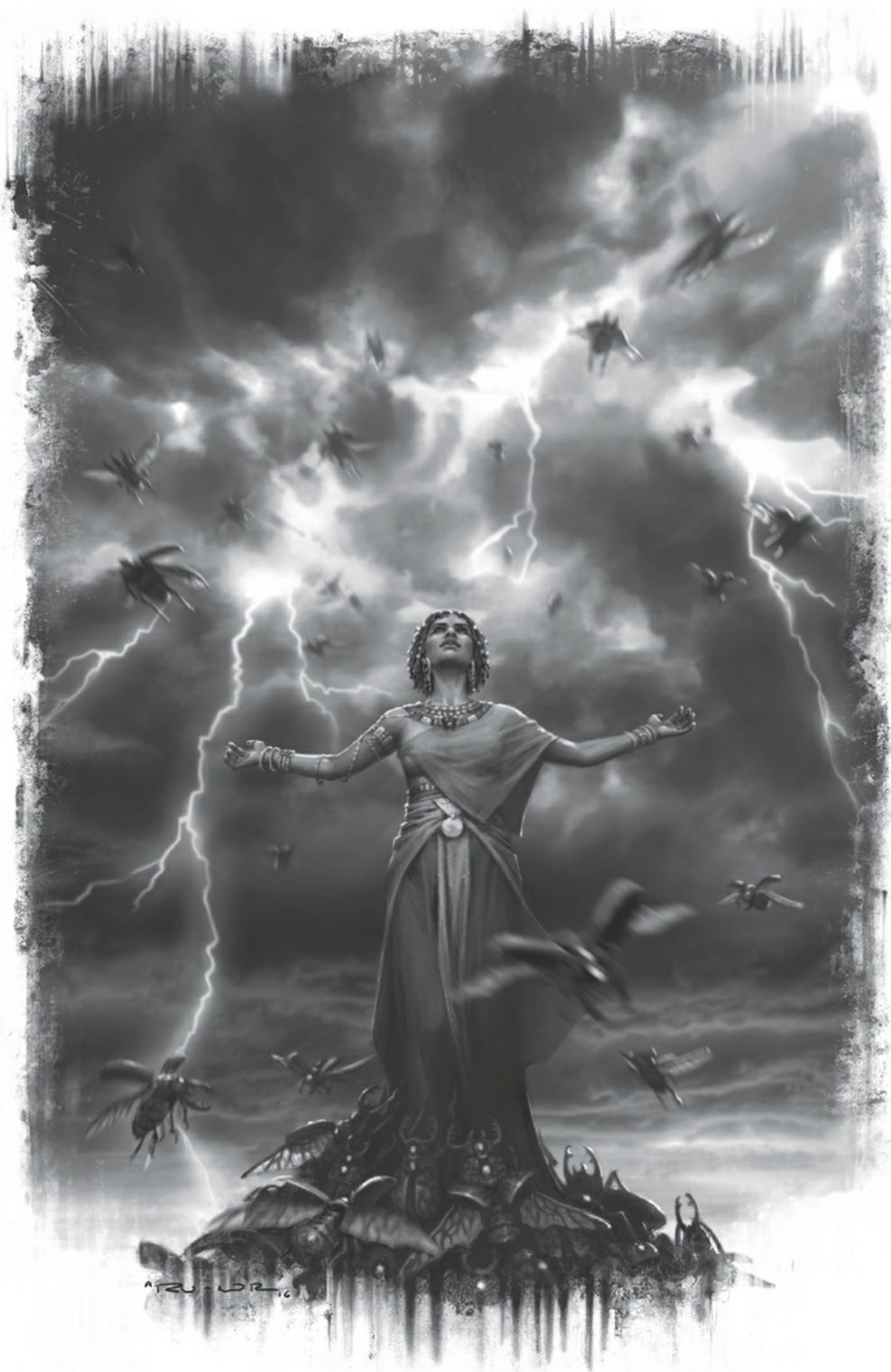
An Egyptian priestess summons a desert storm to cover an ancient burial site for all eternity. Her power is drawn from a vast swarm of large, sentient insects, calling themselves the Great Race, who have long been depicted in Egyptian hieroglyphs, and who are said to hold power over life and death.