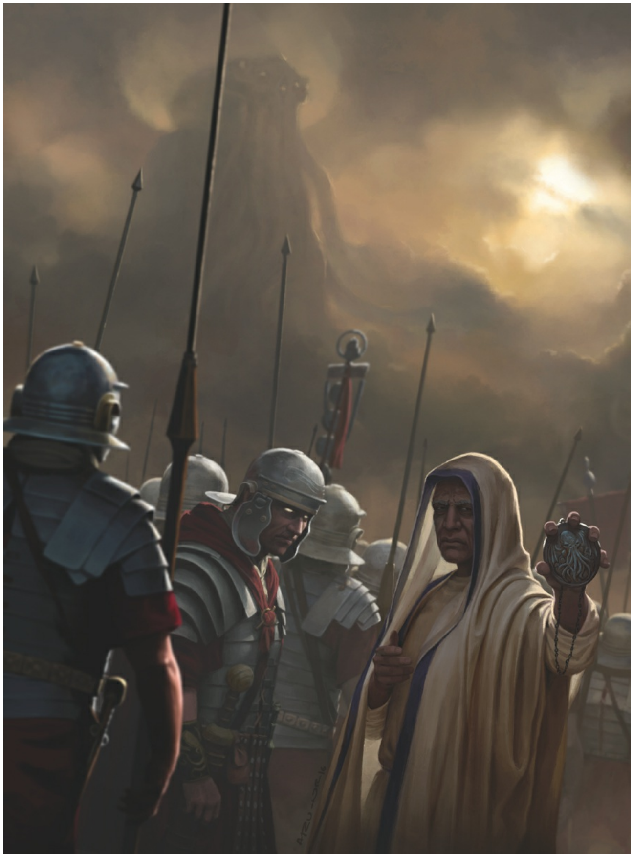
The legions of Rome were the greatest fighting force in the world, their fortunes bolstered by the priesthood's prayers to Cthulhu.