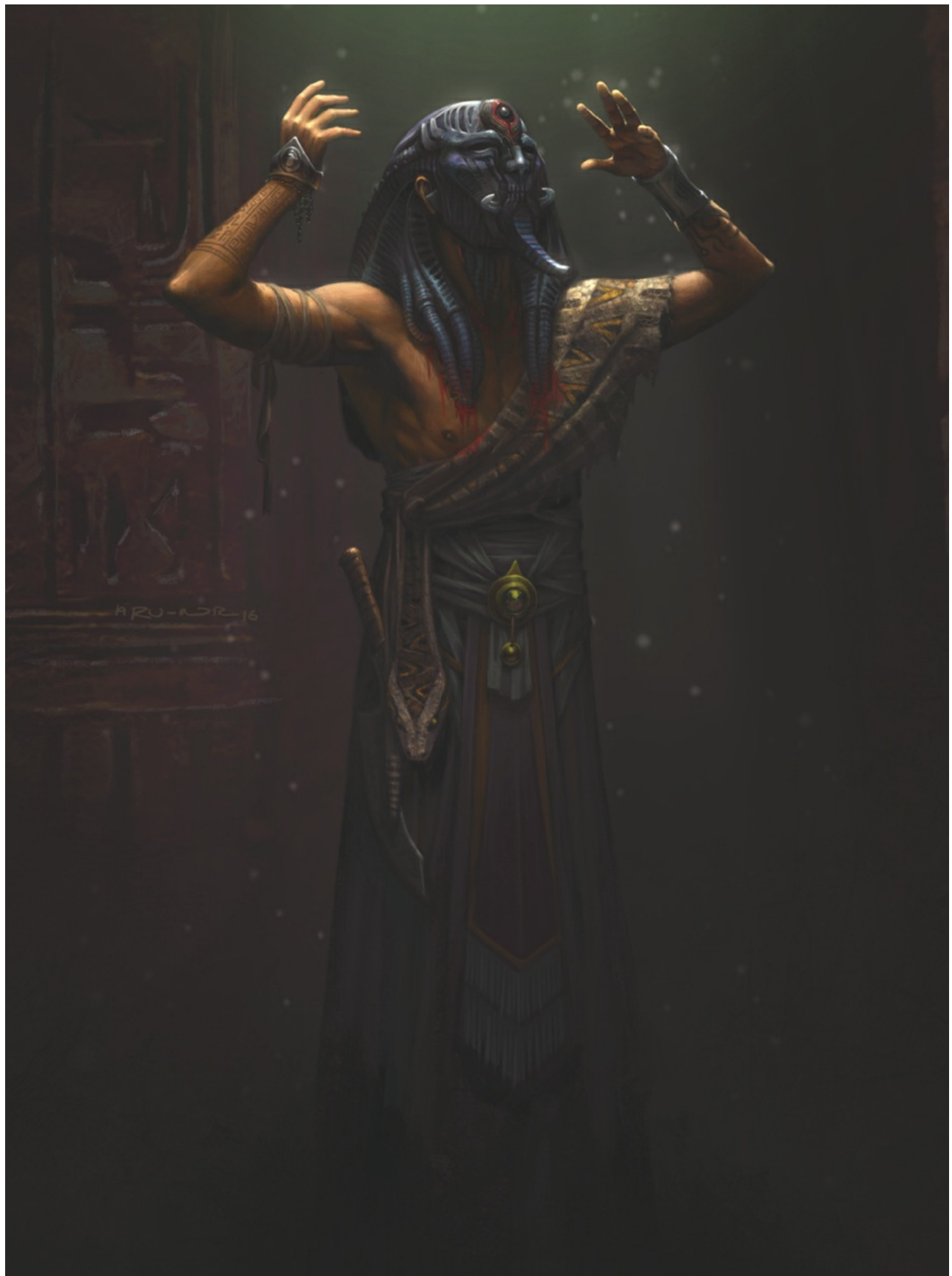
A priest of Nyarlathotep, wearing the mask of the Black Pharaoh.