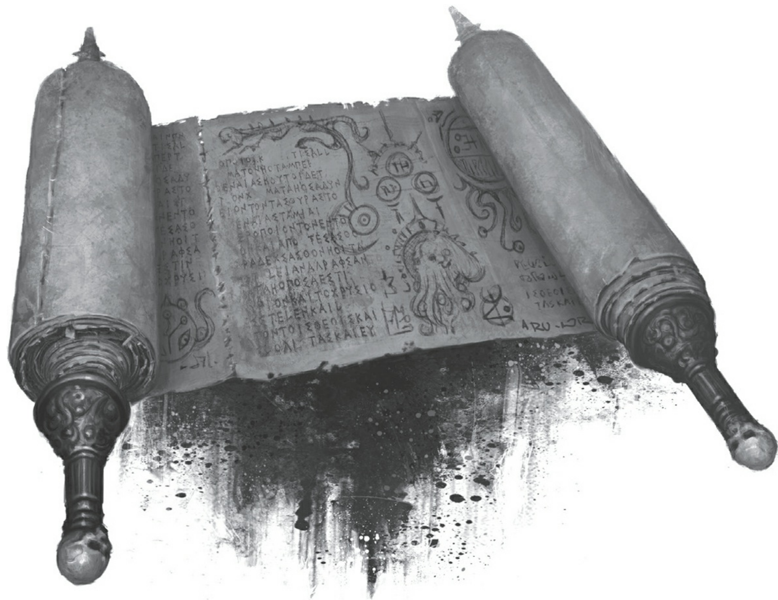
The Peri ton Eibon – the first Greek translation of the book the Romans called the Liber Ivonis , c.100 BC.