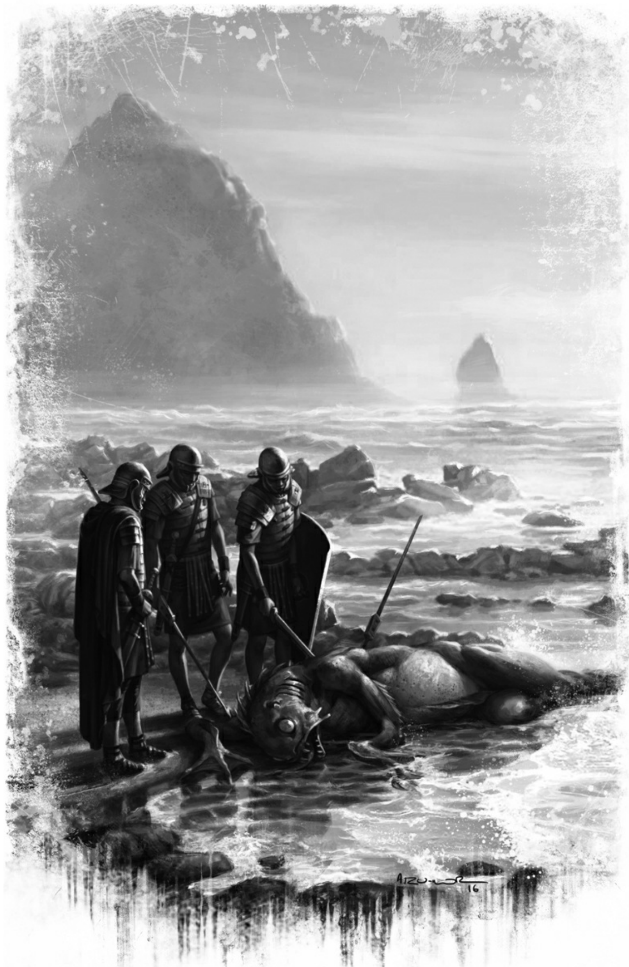
The allegiance of the Deep Ones is at best uncertain, and the priesthood became wary of placing too much faith in these creatures, who