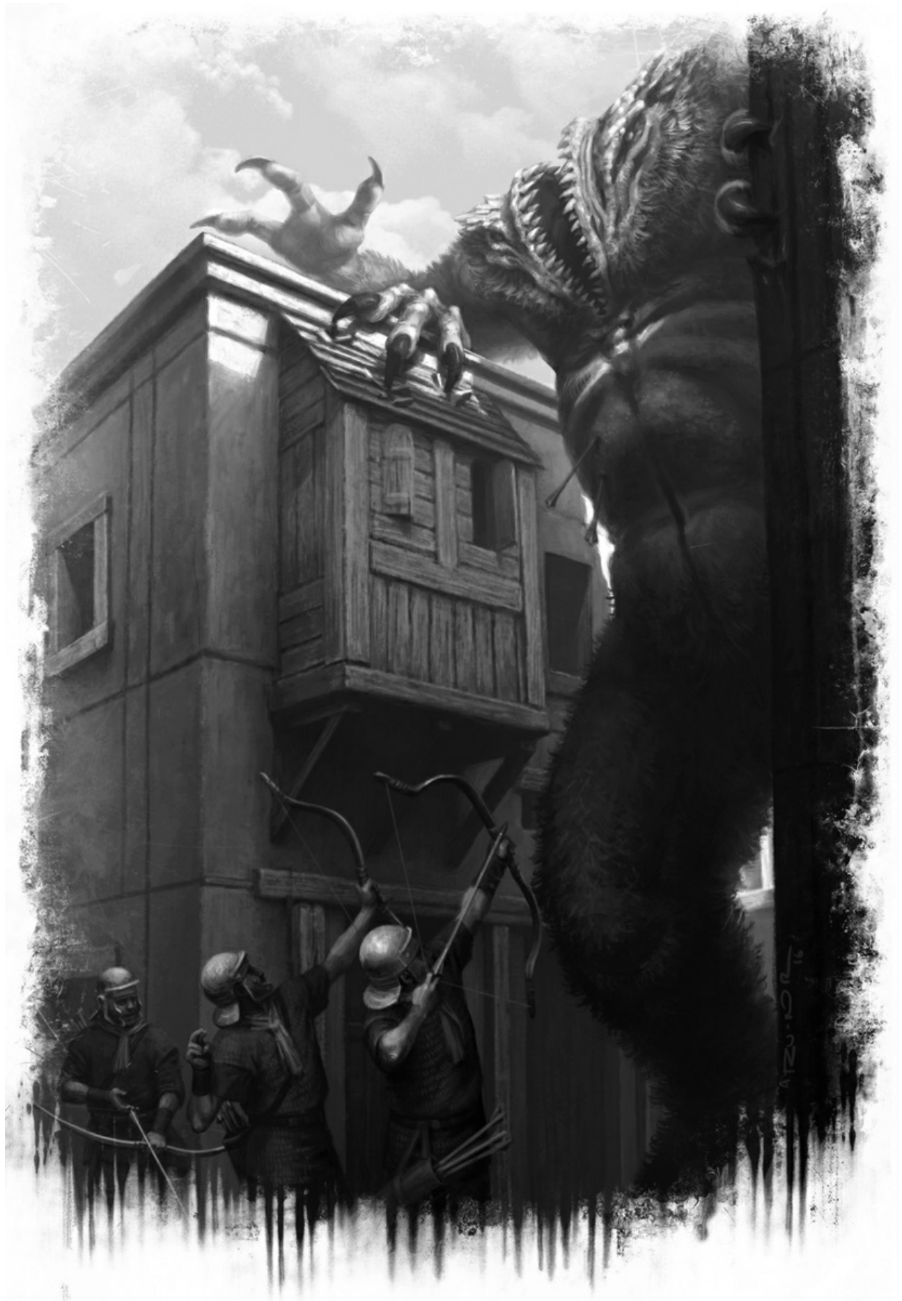
Roman archers try to bring down a marauding Gug in the narrow streets of the Aventine.