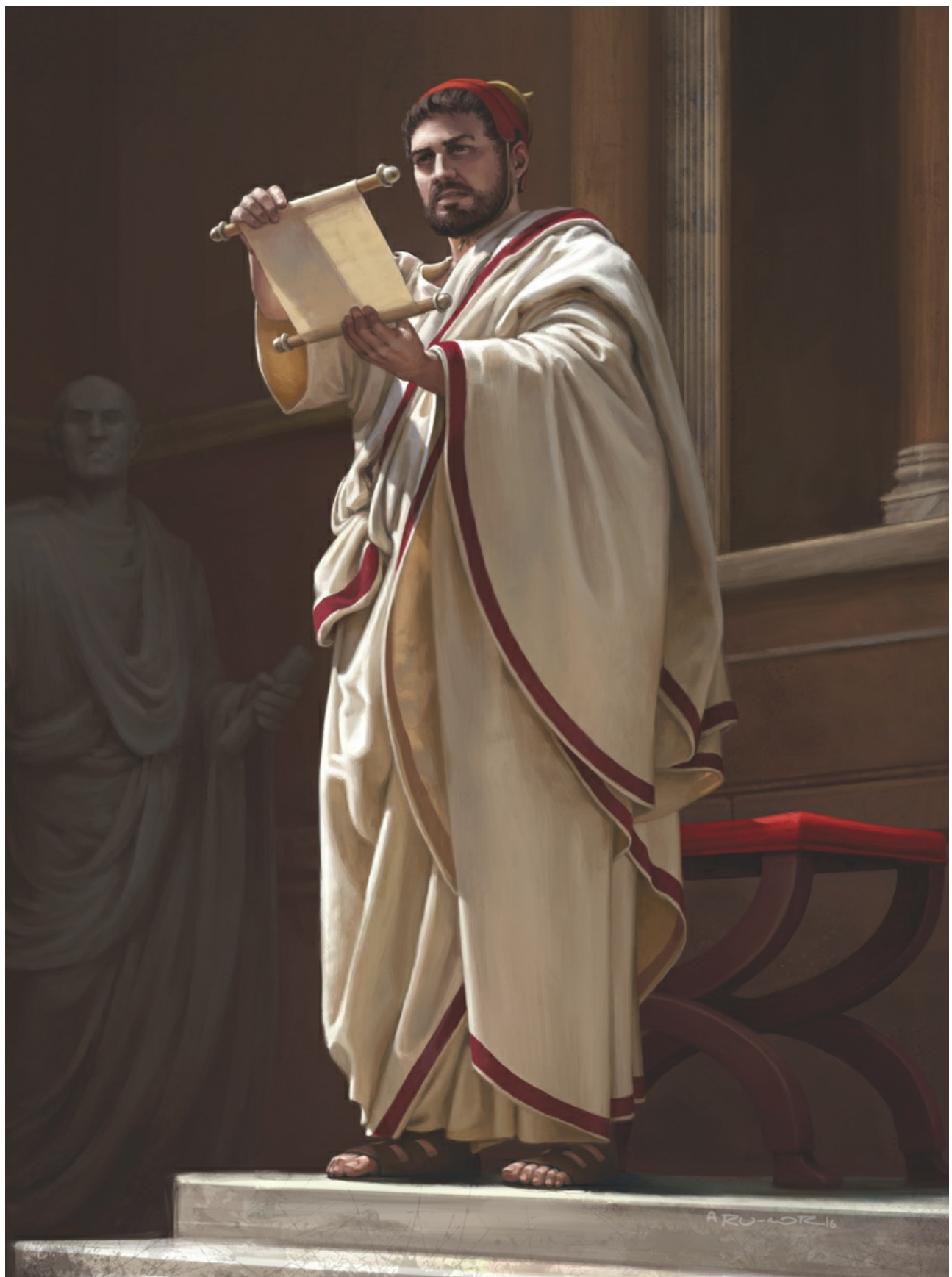
A patrician of the quindecimviri sacris faciundis , keepers of the Sibylline texts, and most powerful priests in Rome.

The practice of ‘magic’ was outlawed across the Empire. The quindecimviri sacris ensured that the state-sanctioned religions, as governed by the pontifices, included amongst their tenets dictates warning against the magi , sagae , and all other practitioners of forbidden rites. Of course, these strictures were put in place only to make the power of the priesthood absolute, for the practice of