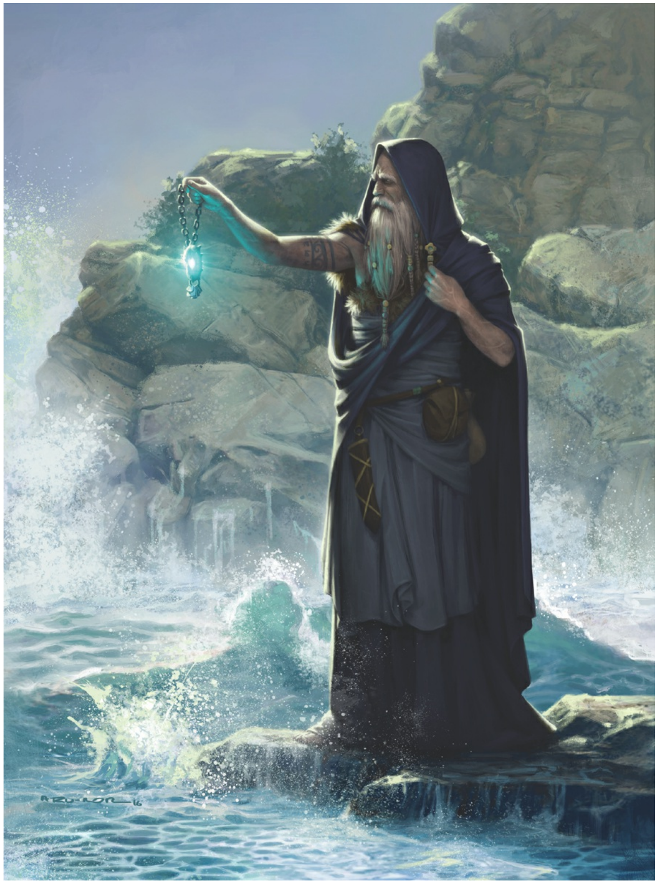
Druid dedicated to the Elder God, Nodens.