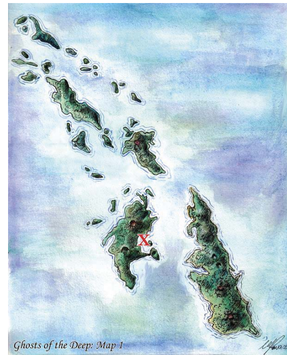
Ghosts of the Deep: Map 1

Skills: A ghost whale has a +8 racial bonus on