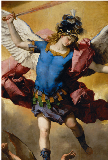
Psalms 91:11 - For he shall give his angels charge over thee, to keep thee in all thy ways.