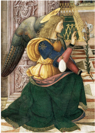
Psalms 91:11 - For he shall give his angels charge over thee, to keep thee in all thy ways.