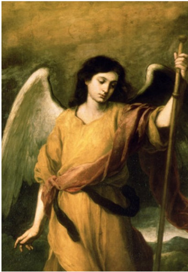
Psalms 91:11 - For he shall give his angels charge over thee, to keep thee in all thy ways.