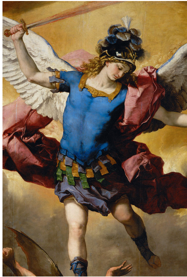
Psalms 91:11 - For he shall give his angels charge over thee, to keep thee in all thy ways.