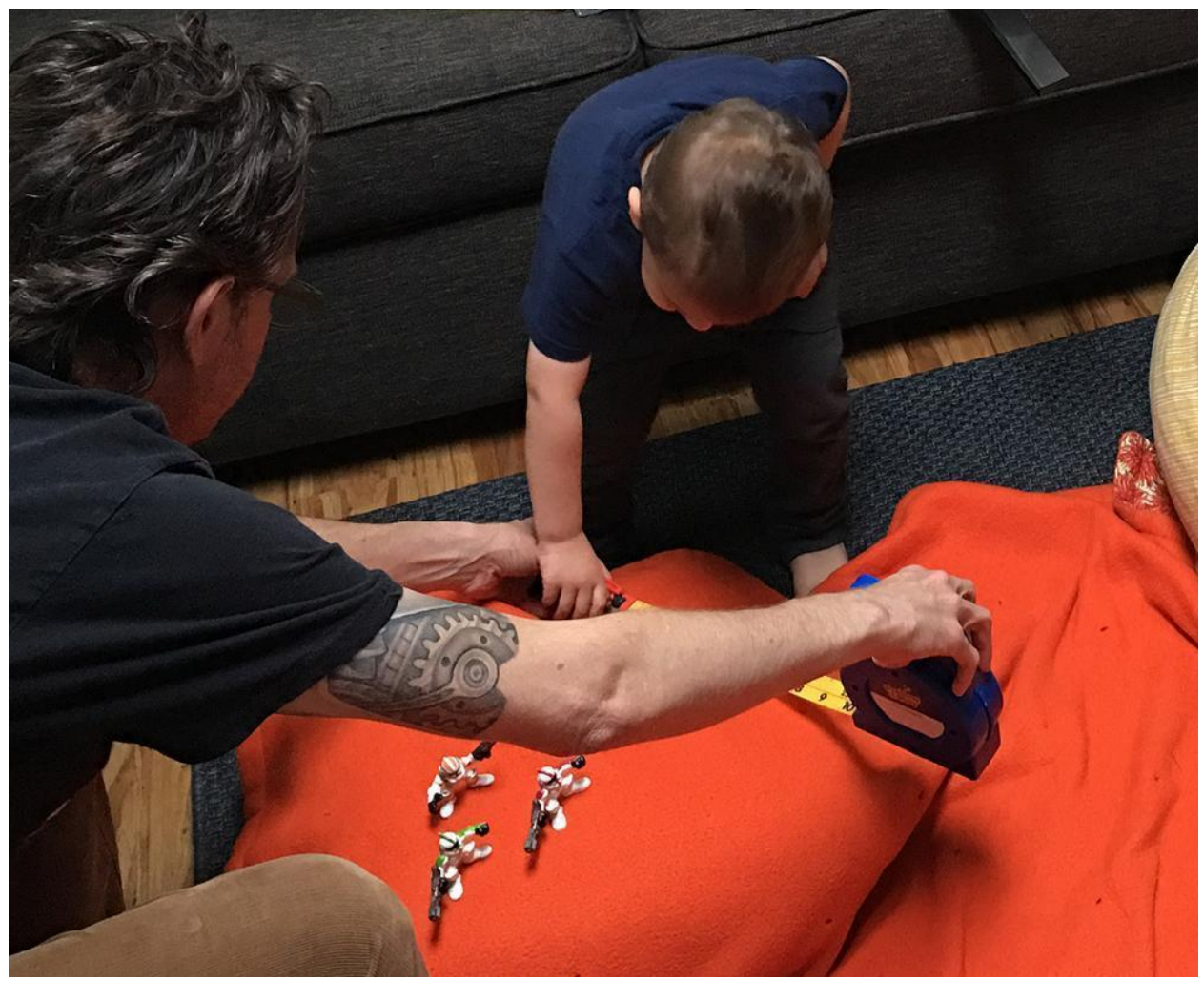
Measuring movement.

Apparently, I'm not very good at judging distances and I set everyone up way too far apart. Only rolling a d4 for movement was taking way, way, way too long for anybody to even be in range to fight. A bunch of moving with no action is not the way to keep a toddler's attention for long. While he had fun measuring out distance for movement at first, he wanted to get to some fighting pretty quickly. He even tried to make his Genosian fly (duh, why didn't I account for that in the movement rules? It will be in the next revision of rules), but I told him he couldn't fly straight to the castle or the game would be over already. So we swapped the d4 to a d8 for to speed things along. I think a d4 is fine if you're using a normal gaming table/setup, but if you want to use a bigger play area, increase the dice appropriately.