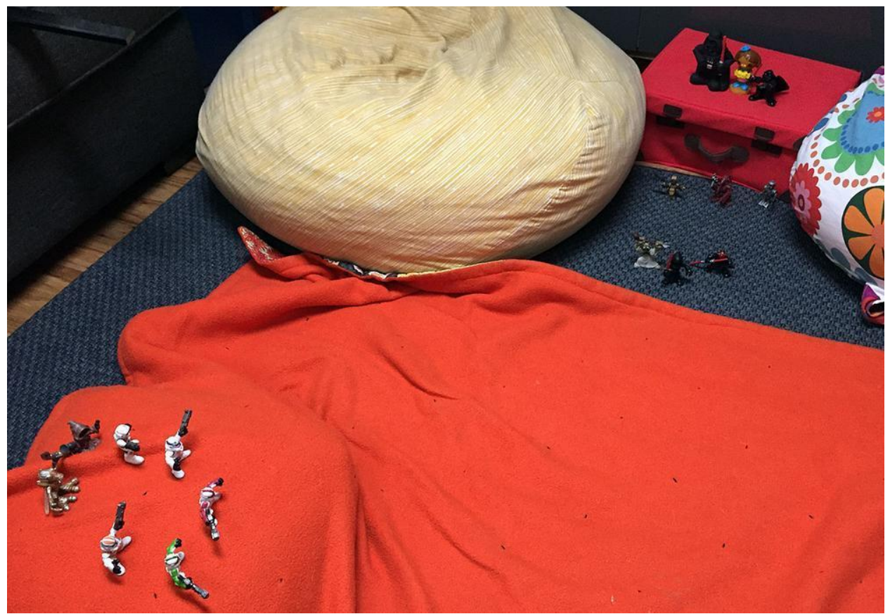
The entire battlefield.

He was having a really good time and we had defeated about half of the bad guys while only losing a couple of troopers after about 15 minutes. He suddenly declared that the Vaders were afraid and they escaped with Dashi–Your princess is in another castle anyone? Considering the tabletop games we usually play only last a few minutes each, this was a record-breaker for sure as far as attention span and fun.