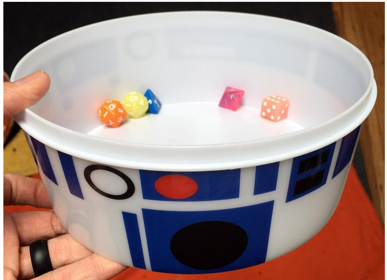
I get bonus points for using an R2 lid as a dice tray right?

Remember, rules flexibility is essential at this point, but you also shouldn't continually change rules that are working just to keep your child invested. There's a fine line between, and even an art to, teaching them game rules and sticking to them versus recognizing a rule needs to change to make the game viable for your child.