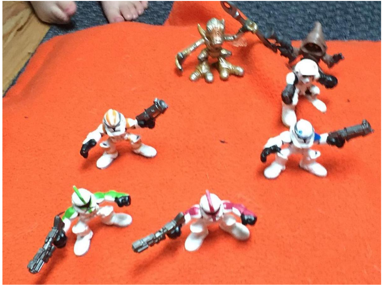
Clones assemble!

I then had him choose a handful of guys to help the Vaders defend the base and a rescue team to try to break-in. He chose Zuckuss, a battle droid, IG-88, a Tusken raider, Kylo Ren, and Darth Maul to defend the base, and I helped him set them up with the ranged guys closer to the entrance and the melee fighters out front. He then chose, essentially, a clone trooper squadron (with a scout trooper, Genosian warrior, and Jawa thrown in for good measure) as the rescue squad.