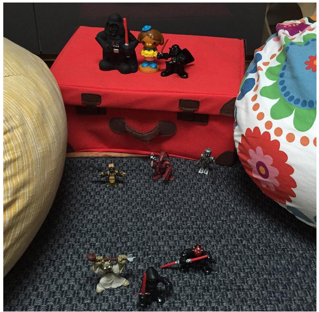
Castle Vader and the princess.

I put a red cloth case we have down between our two bean bag chairs and declared that it was the base. And then I laid out an orange blanket (sand) with a pillow under it (sand dune) as the main playing field. My son then grabbed two different Darth Vaders and a Dashi (from The Octonauts ) and put them into the "castle." There was our story–rescue Dashi from the bad guys.