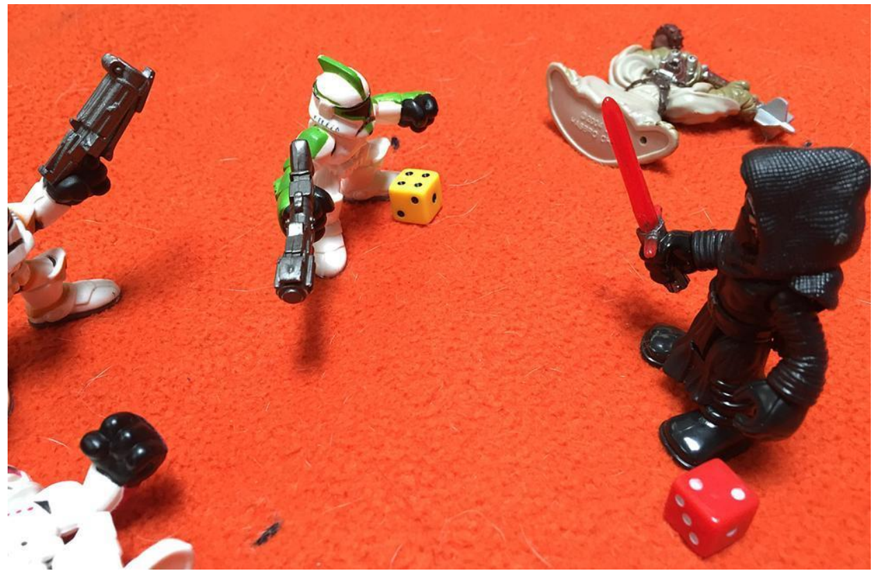
Kylo vs Clone.

Once we got into range, he really started having fun and quickly grasped the difference between a character with a blaster (or "shooter" as he calls them) and a melee weapon. Measuring distances to find the to hit and rolling dice worked out really well, and he enjoyed that part. Because I only had the small six-sided dice as counters, I also decided everyone would just have 1d6 hit points to make things easier.