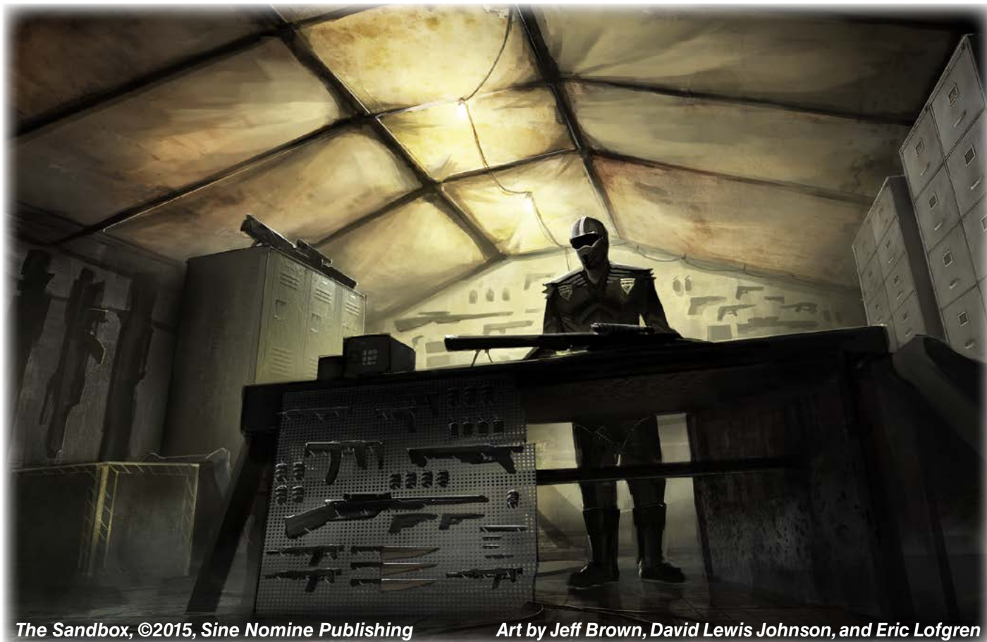
The Sandbox , ©2015, Sine Nomine Publishing