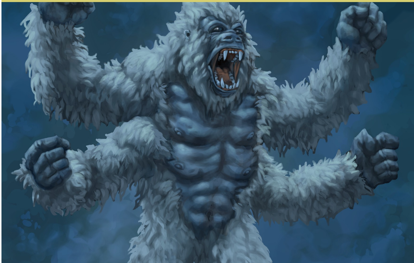
Girallon Also Appearing: