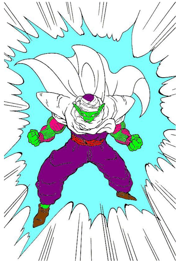
Piccolo, the Namekkian warrior, powers up!

Level advancement happens in a 4 part form. First you have the characters normal Class Level. This level is unchanged in its use of keeping track of class advancement and general character advancement. After this you have a person's Power Level. This is the thing that separates the heroes of DBZ from normal people. For example, while Goku may have a lower Character level compared to that of some humans, his power level easily dwarfs their power levels and over all character level. Finally there is the character's Power Up rating. This works in