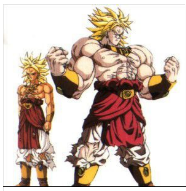
Broly, the Legendary Super Saiyan, is practically an unstoppable Juggernaut. He is a prime example of Saiyan endurance and strength.

In DBZ, characters often boast incredible raw physical strength, speed and endurance. This does not mean that they have pumped energy into their muscles to make them stronger and faster. This is sometimes just raw natural speed and strength. In a DBZ game setting, characters generally get 32 points to spend on their Ability scores. However characters in the DBZ world can also increase their physical abilities through intense training. If you're making a level 1-10 character use only 32-45 points for your attributes. However if your making a character who is above level 10, add 2-4 points for every level above 10 that the character is.