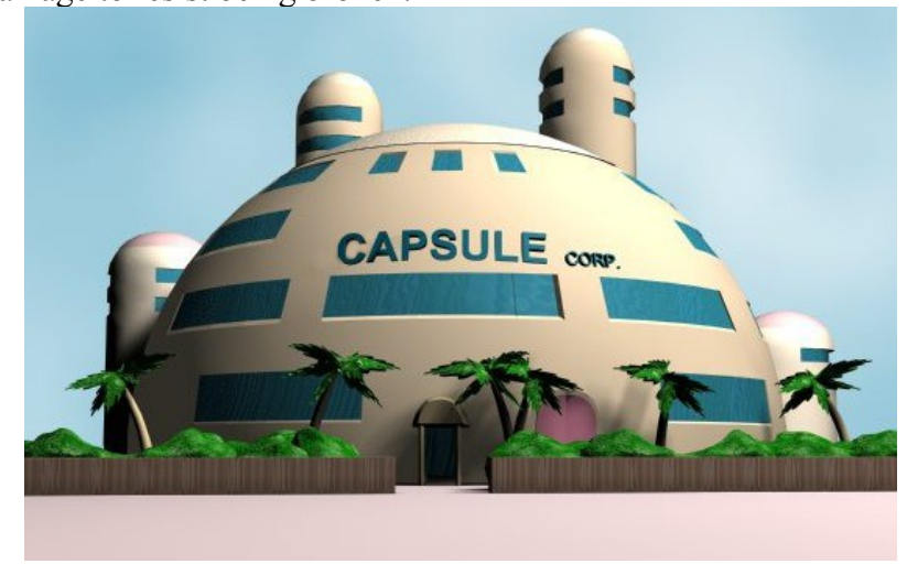
Capsule Corporation is the primary supplier of just about everything in DBZ short of food. Their technology is second to none, and can take a house and turn it into small portable capsule, thus the name Capsule Corp

You can only get certain things capsulized, some things are too small for