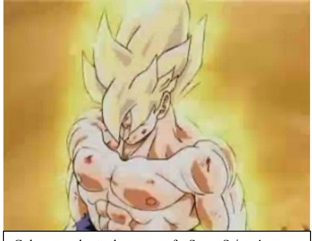
Goku upgrades to the power of a Super Saiyan!

This is a new concept made especially for this game. Spending Experience points to increase ones capabilities works, but sometimes you just want a more stream lie method of doing things. Additionally may be you don't want to increase your characters level or Power Level/Power Up. Maybe you would like to improve upon their skills, or get them some extra feats for that tough fight ahead. Perhaps you want them to advance their techniques so they can put more energy into them. O