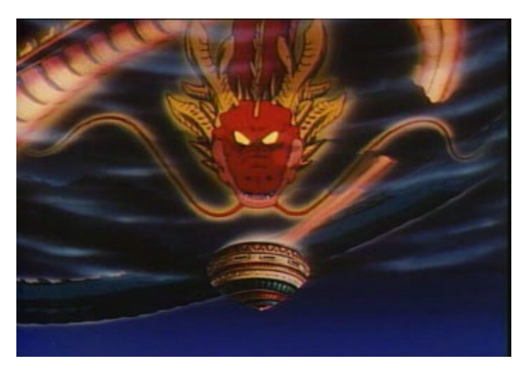
Dark Shen Ron is the eternal dragon summoned by the Dark Star Dragon balls, the first dragon balls created by Kami when he first came to Earth. They are the most powerful dragon balls in existence, they grant only one wish, and will destroy the planet that the wish was made unless they are returned to the planet with in 1 year's time.

This is an enhancement to the rules found in the d20 Modern player's handbook. As you undoubtedly know by know that you will need away of governing characters Power Levels and character levels, along with those of enemies encountered. Generally ECL means Encounter Level, but with these rules it means Equivalent Character Level. This is what a character gains by having a high power level. Now the rules for d20 Modern have characters generally limited in level to level 20, although this is up to the GM. This is however how I limit things. This helps keep characters grounded to some degree when interacting with normal people. It also puts a limit on their negree of skills and chilities with all of their systems.