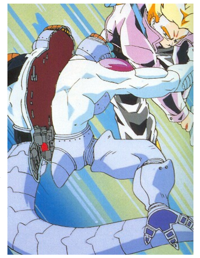
Trunks show's Frieza that the Power Attack and Spring Attack feats aren't just for show.

In order to gain a Bonus Feat through expenditure of CAP's a character must spend 5 CAP's per feat they want. This of course will result in some characters possessing capabilities above most other normal characters. If you look around in the world you'll notice