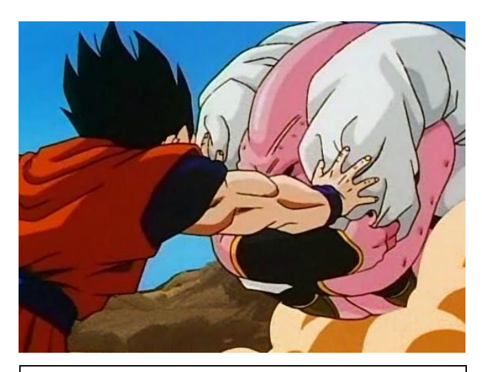
Fusion Majin Buu tries to show Super Gohan, one of his many special Techniques.

Least to say that combat in DBZ is on an epic and cosmic scale, depending on when it takes place. Combat is pretty much that same as it is in d20 Modern. Only with DBZ the characters can have more actions and can do more damage. So start off I'll first cover the combat applications of super speed. After that I'll move on to super strength, and powers.