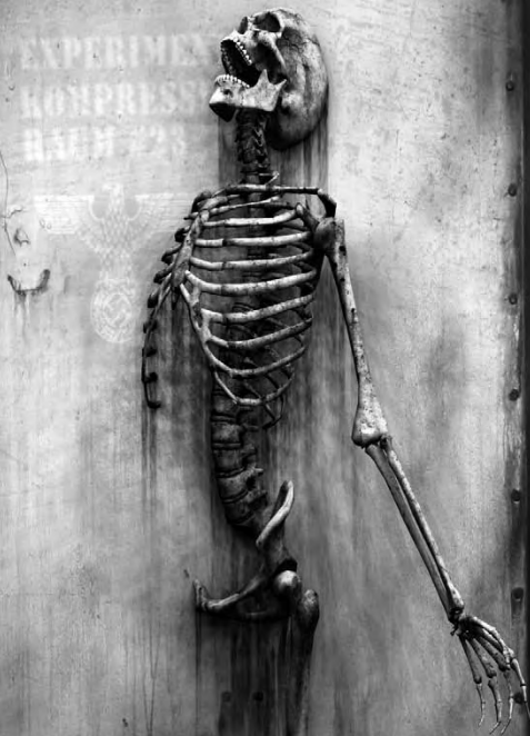
The remains of individual found fused to the wall of Experimental Compression Chamber 23 at site #458/76/B. Remains destroyed during removal.