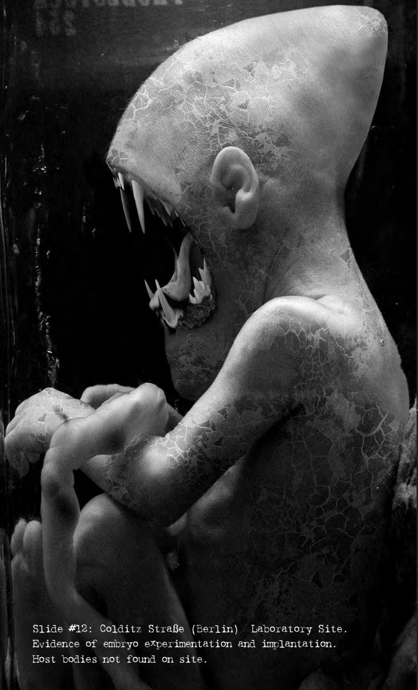
Slide #12: Colditz Straße (Berlin) Laboratory Site. Evidence of embryo experimentation and implantation. Host bodies not found on site.