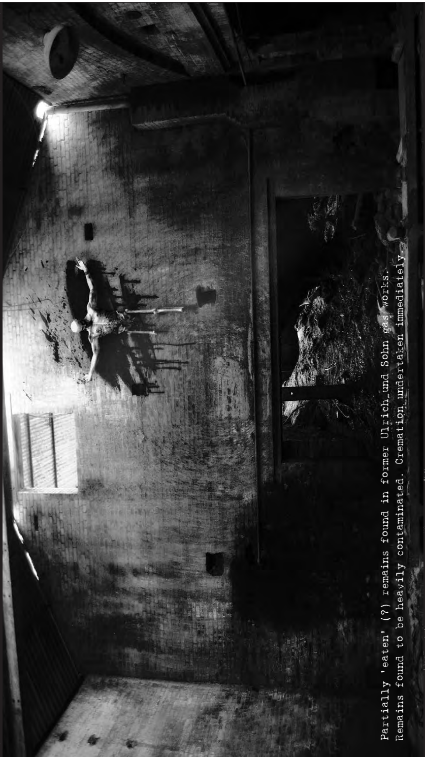
Partially 'eaten' (?) remains found in former Ulrich und Sohn gas works. Remains found to be heavily contaminated. Cremation undertaken immediately.