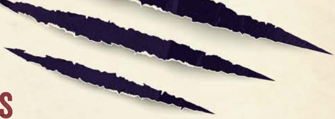
EXHIBIT No. #11 COLLECTIVES

The MC booklet will refer you here when you enter a fight with a large group of similar adversaries: