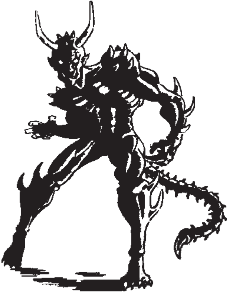
A MALE BALANKORI