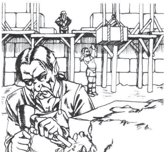
TABLE A.1 - ARTISAN