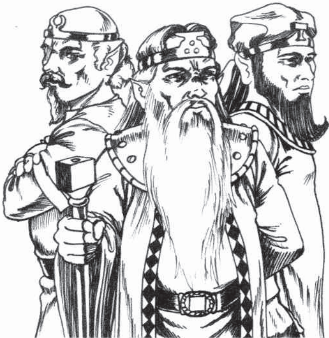
THE FOREFATHERS - LUCHORPAN, DURIN II AND PTAH

The Children of Ptah, bitter at their treatment by their brethren, fled south across Europe to the warm lands of Egypt, which in Dwarven mythology is thought to lie close to Muspell . Here they settled in the mountainous south, where they became proficient in the working of gold, a substance Egypt had in abundance. Their skill was second