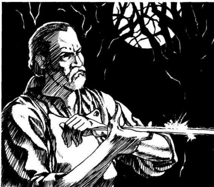
"Forging with moonlight & silver a sword fit for a King."

This spell turns red-hot metal completely molten. Anyone touching the metal suffers 1 x Crit Die in burn damage. If wearing metal which cannot be instantly dropped, such as armour, then 2 points of extra damage for every 5 lbs of metal armour worn is suffered. The amount of metal which can be heated is 1 lb x ML squared of metal.