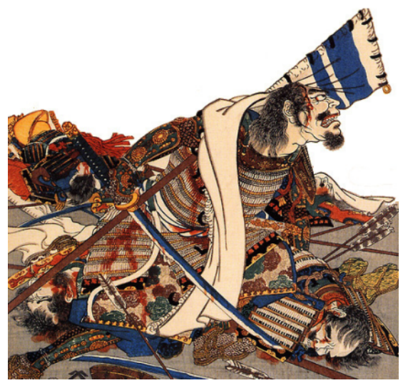
Special Conditions (Magical and Mundane)

Subdual damage represents getting buffeted and battered. Tactical attacks can deal subdual damage, and the GM may apply it in other situations like a fall into water or meditating under a waterfall. Subdual damage is totaled. When it surpasses current hit points, the character falls unconscious until the damage is healed. Subdual damage disappears after a one hour rest, or with any application of healing.