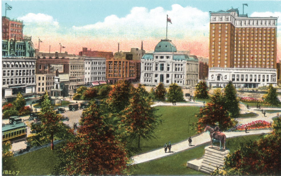
City Hall and Providence-Biltmore Hotel, Providence, R. I.