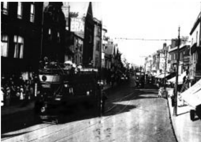
Trams in Sidwell-Street - 1900s

Skills: Accounting 40%, Anthropology 20%, Botany 30%, Credit Rating 35%, Dodge 38%, Drive Auto 50%, First Aid 31%, Geology 19%, Law 75%, Library Use 30%, Mech Repair 46%, Psychology 53%, Ride 35%, Spot Hidden 64%, Track 30%