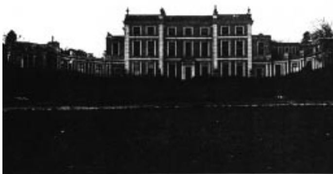
LOT 1, HALDON HOUSE—SOUTH ELEVATION