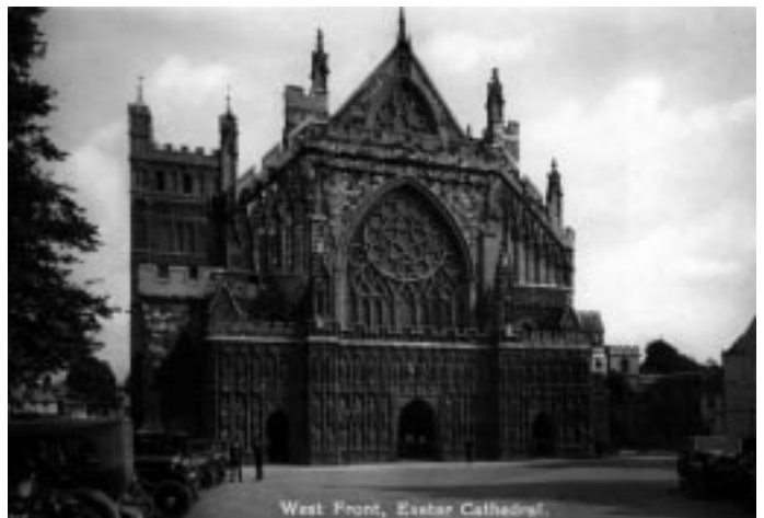
West Front Exeter Cathedral - 1920s

Exeter at this time (and indeed to the present day) is a provincial city in the heart of Devon. Close to the wilderness of Dartmoor, it is some 170 miles from London. Exeter was founded in 50AD by the Romans as a barrack town and as such may have had many Mithraens - temples for worshipping Mithras, the Persian god of light. However, this connection to the Romans is purely coincidental and Exeter became an important cloth manufacturer, agricultural centre and a busy port, remaining so until the eighteenth century when it was superseded by Exmouth and Plymouth as larger ships were not able to draw enough water to travel up the Exe Canal. Exeter has always been a base for insurrections and was Monmouth's capital in the plot to overthrow James II in 1685. The important cathedral was built by Saxons in 1050AD but by the fourteenth century had almost totally been rebuilt by the Normans, featuring the famous gothic west front. Interestingly enough the last witch in England was hung here in 1648.