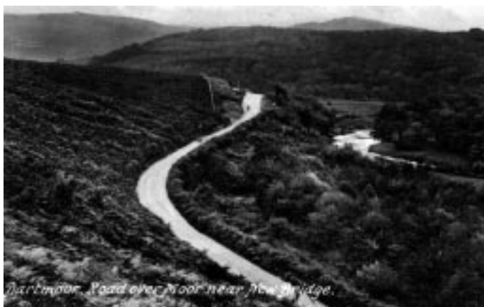
View of Dartmoor

Skills: Anthropology 60%, Archaeology 70%, RWS Hindustani 50%, RWS French 30%, RWS Ancient Celtic 12%, Linguist 20%, Mech Repair 30%, Credit Rating 40%, Occult 18%