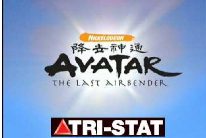
- Creating your character using the Tri-stat System

Roll 4d4 four times and drop the lowest score, 3 scores = 4-16 (avg 7-10) +27 character points (CP), OR arbitrarily assign with 75cp total to stats and attributes.