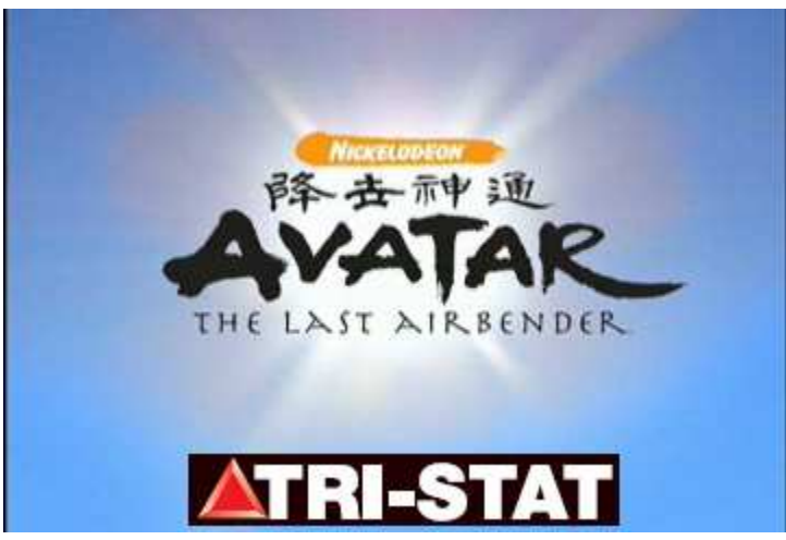
- Creating your character using the Tri-stat System

Roll 4d4 four times and drop the lowest score, 3 scores = 4-16 (avg 7-10) +27 character points (CP), OR arbitrarily assign with 75cp total to stats and attributes.