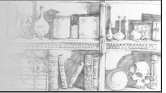
TABLE FOR RANDOM DETERMINATION