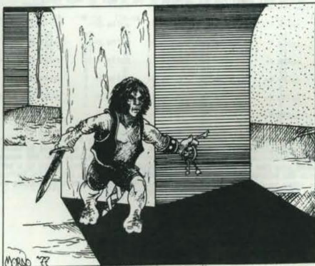
BARBARIAN HOST (1)

Yes, it is at the Inns where a young boy just turned warrior and a young girl aspiring to magikal lore can meet and mingle with all the strange and fabled races of the multiverse. Here one can see the silent and shiny-chitined Phraints, the feared and fanged warrior Saurigs, or perhaps even get a glimpse of even stranger beings. The Inn or Road House is a place of intrigue and mystery as well as music and brawls. They should be an integral part of every world. So here for your perusal are the Inns and Road Houses of Arduin. Who knows, they may find their way into your world as well; after all, stranger things have happened in the multiverse before this!