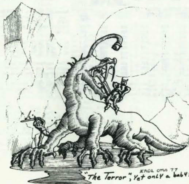
"The Terror", yet ONLY a baby!

Here is a handy way to figure out wet measures (I know it's not exactly right, but it's how it is done in my multiverse): A vial is 1 ounce; a flask is 1/2 pint; a bottle is a pint (that's a small bottle; a large bottle is a quart); a wineskin is 2 quarts; a keg is a gallon; a hoghead is 3 gallons; a barrel is 5 gallons; a cask is 20 gallons; and a "Royal Cask" is 55 gallons. Screwy, but it serves the purpose quite well. By the way, the most common measure of ale or beer bought is a one pint flagon, although two pint flagons are fairly common also.