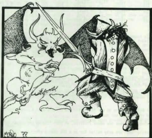
DWARF AND BOOGIE MAN

Note: Only three tries are allowed per door per game. Failure means it's stuck.