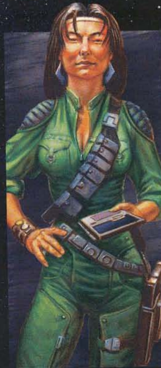
Technical Specialist (Human)