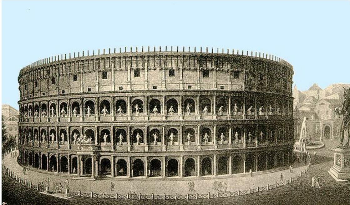
The Arena of the Gods <above> the "mob" spectators <below>