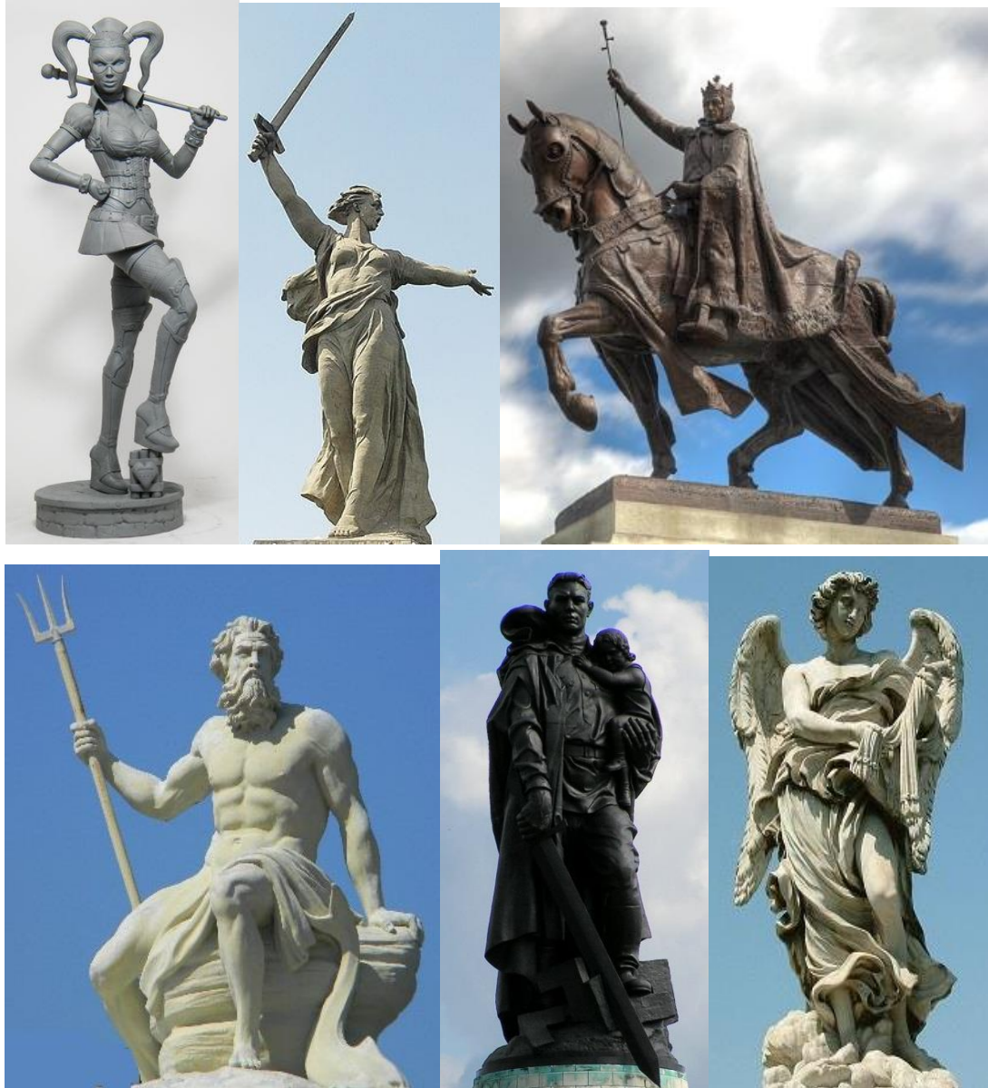
Statues of the "Six Victors of the Arena" that ring the top of the stadium

Sister Marietta, Vodrus of Barbaria, Sir Breen of Mellowmarble, Captain Ahab of the Lost Islands, Waylan the Mystic, Adrienne of the Winged Folk are all champions of the arena after winning their four challenges. Each is a legend of their land with only Waylan staying in the Torlaian Empire and part-time master of ceremonies at times. He is renowned for his soft spot for children. The other victors all returned to their homeland.