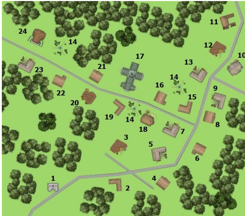
Penchant <above> the Graveyard <below>