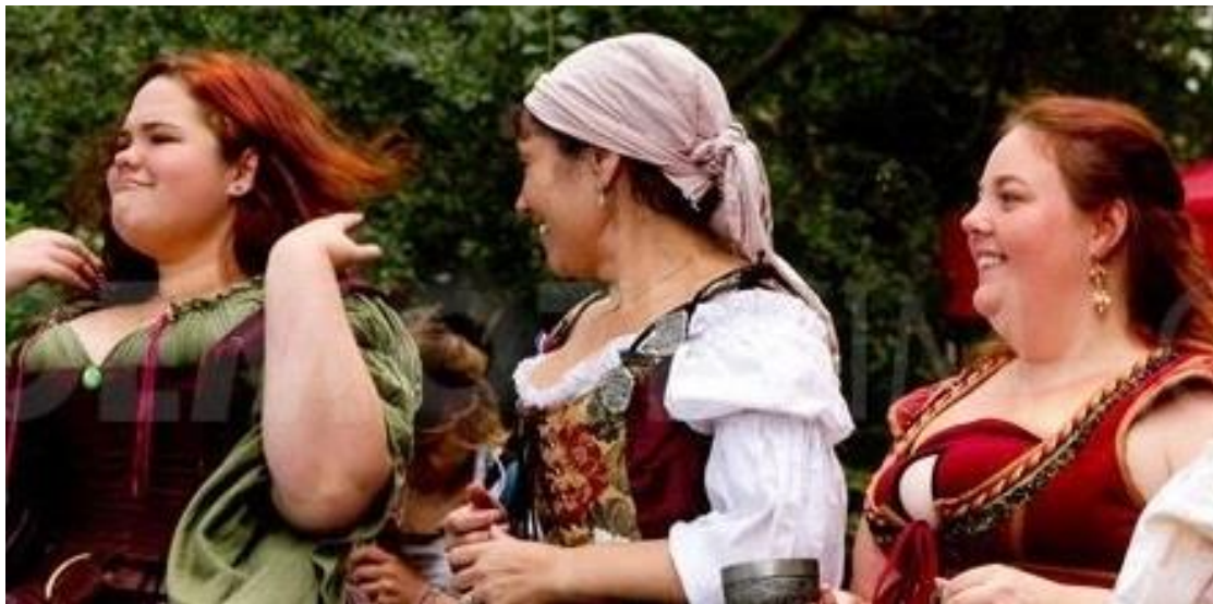
Images for the players – Clerical robe, checklist from the room, festival goers