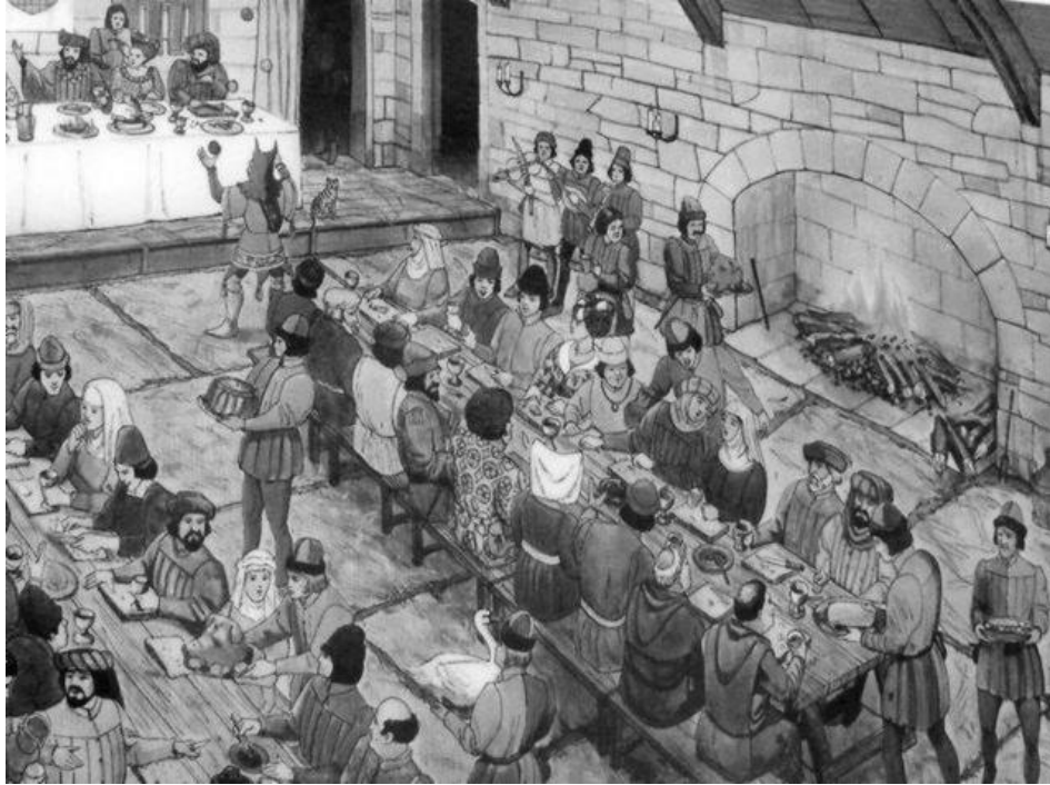
Banquet Setting <above> Home of the Bu-San Monks <below>