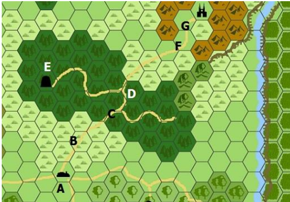
DM Area Map <above> Penchant Map <below>