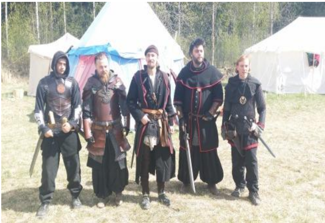
The Dirty Pants Gang

The party will also be met by members of the local nobility. These men will have the funds available to give to the party if they have defeated (and have proof) the Dirty Pants Gang. The celebration will go through the night and the PCs will be allowed to stay the night in the Dancing Maiden. In the morning a grateful alchemist will present them two Potions of Extra Healing as a reward. The party will thanked profusely and each will be given a “care package” of homemade meals on their way out of town as well.