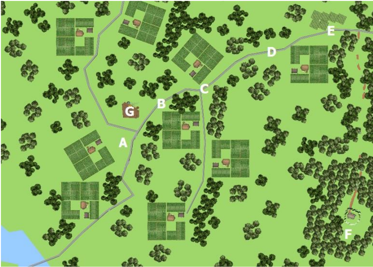
DM Area Map <above> Baby Chick size <below>