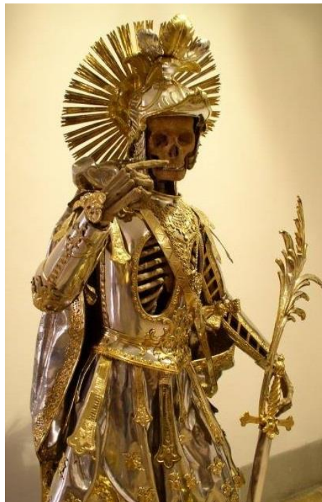
Just another encounter welcoming you to Calentria!