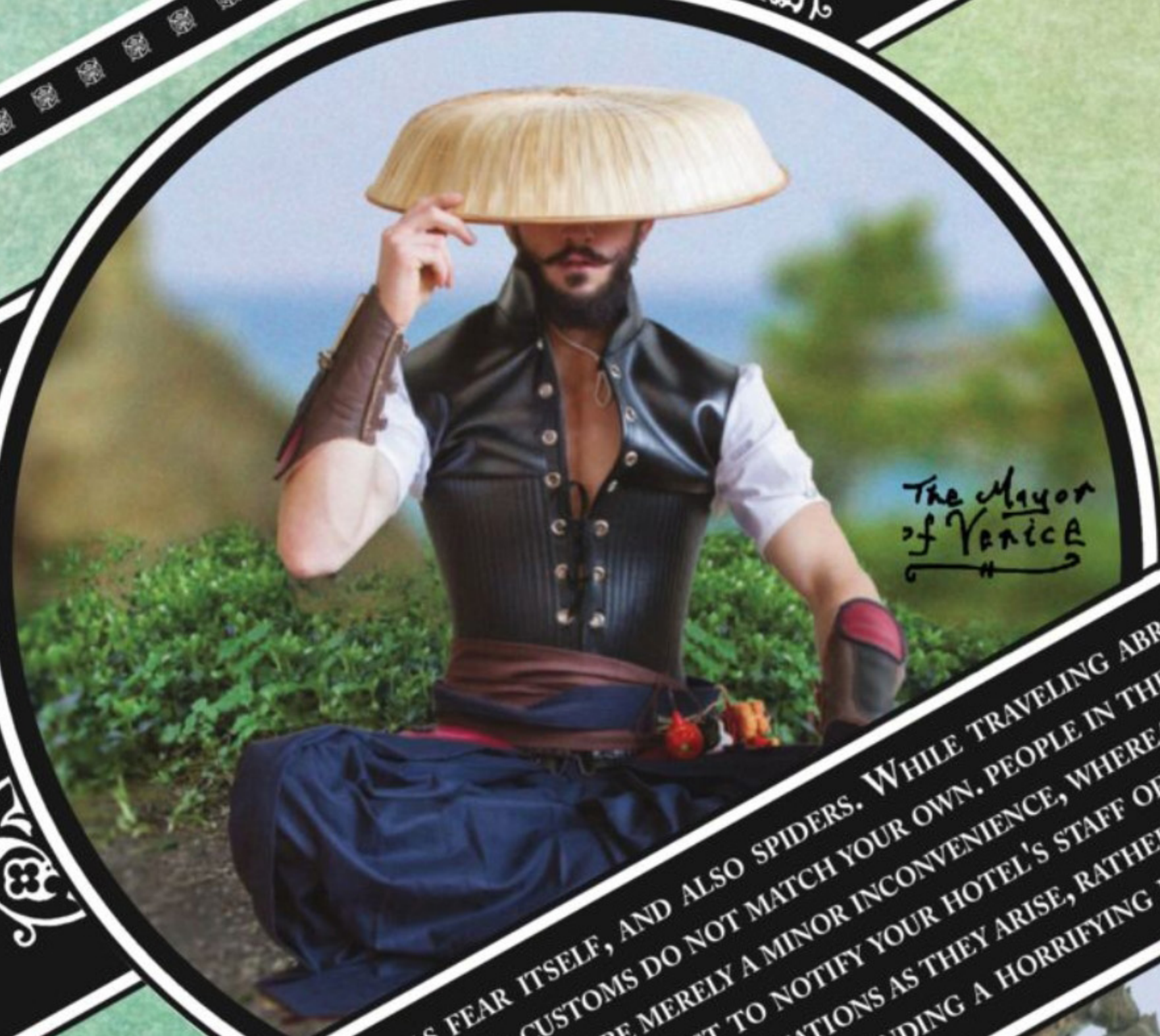
The Mayor of Venice

THERE IS NOTHING SO TERRIBLE AS FEAR ITSELF, AND ALSO SPIDERS. WHILE TRAVELING ABROAD YOU MAY FIND YOURSELF AT A HOTEL WHERE THE LOCAL CUSTOMS DO NOT MATCH YOUR OWN. PEOPLE IN THE TROPICS MAY FIND A CANOPY OF SPIDERS DRAPED OVER THE BED TO BE MERELY A MINOR INCONVENIENCE, WHEREAS YOU MAY FEEL UTTER CONTEMPT AT THE THOUGHT. THEREFORE, IT IS BEST TO NOTIFY YOUR HOTEL'S STAFF OF A PROBLEM BEFORE YOU CHECK OUT. HOTELS PREFER TO REMEDY UNPLEASANT SITUATIONS AS THEY ARISE, RATHER THAN FACING CUSTOMERS WHO ARE IRATE WHEN THEY HAVE TO PAY THE BILL AFTER SPENDING A HORRIFYING NIGHT COVERED IN SPIDERS.