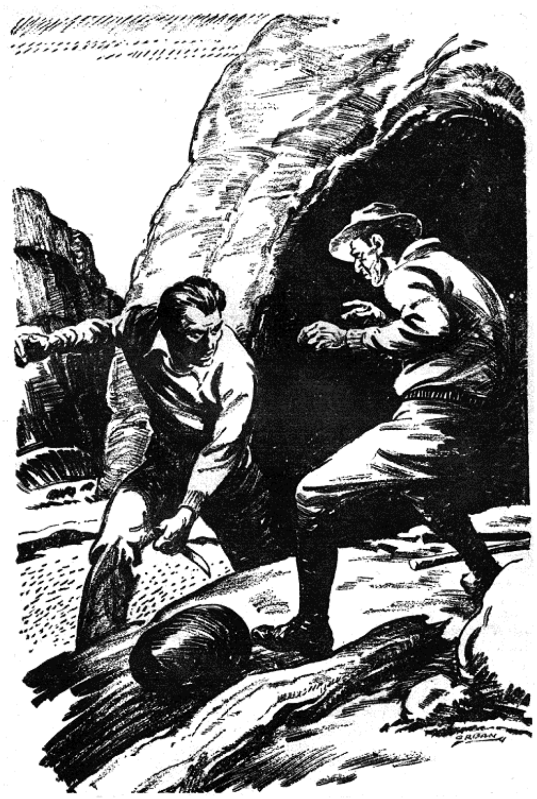
Johnny maneuvered to get hold of Harmony's knife!

Rounding an angle, Johnny got out of sight before Sam Harmony had the opportunity to take another shot at him. He