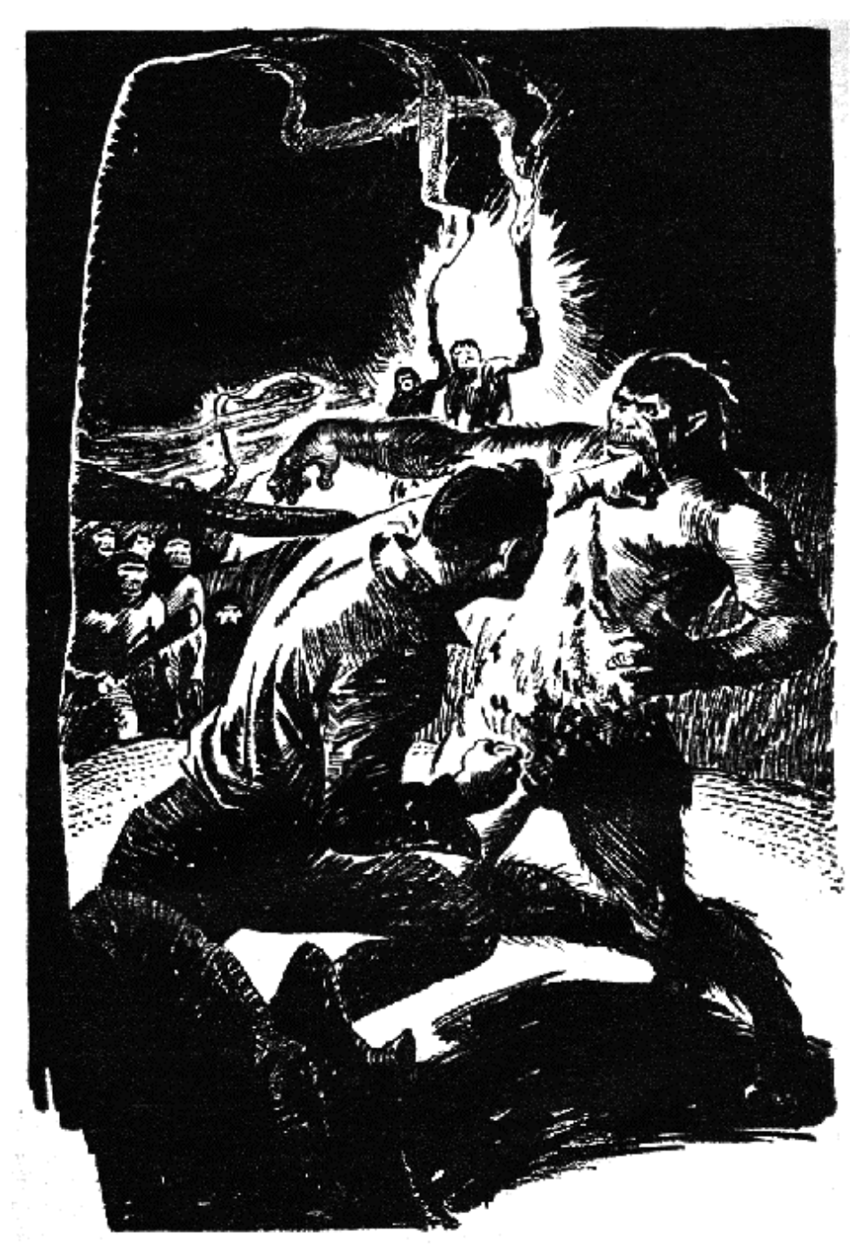
Doc landed a left hook squarely on the big jaw of the primitive man!

THE next few minutes, Doc knew, would be the most difficult of all. A wrong gesture would bring the cavern men upon him in a pack, and he could not hope to defeat all of them.