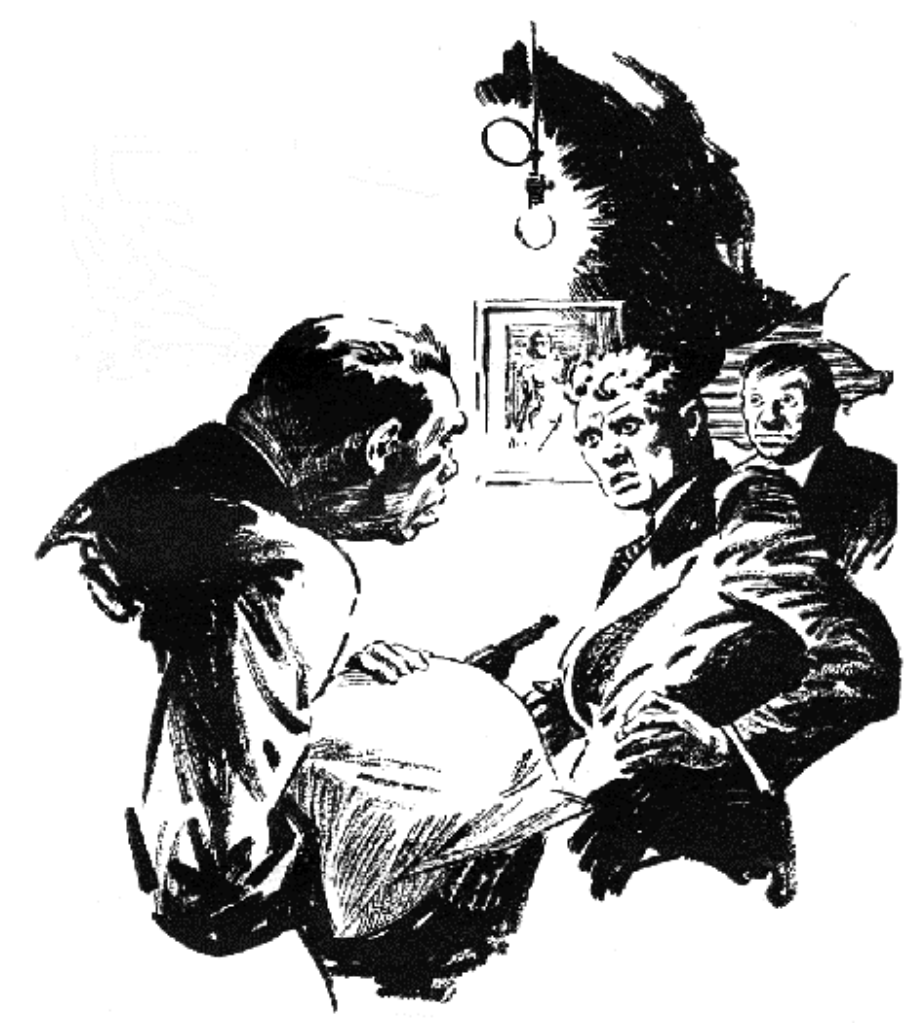
Fancife stood with a cocked gun, and his left hand gripped a pillow!

Two Wink had started worrying over his own suggestion by the time he came back with a chloroform bottle that was widenecked and stoppered with a wadded rag.