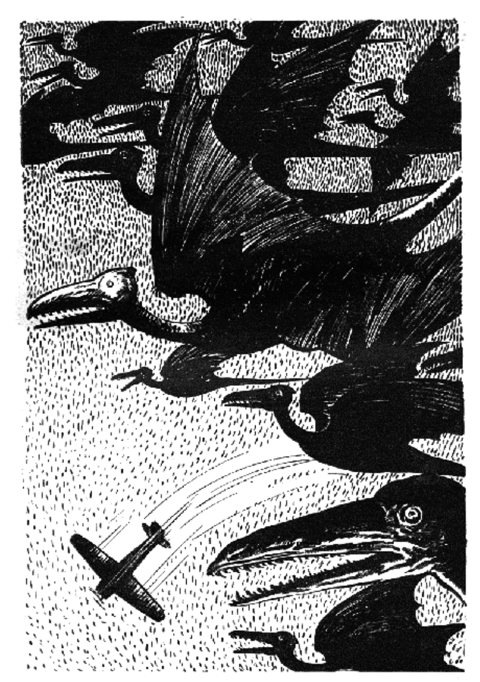
The strange birds chasing the plane had teeth—and were totally hideous!

The squadron of weird flying monsters went winging on, apparently unaware that their quarry was not ahead of them.