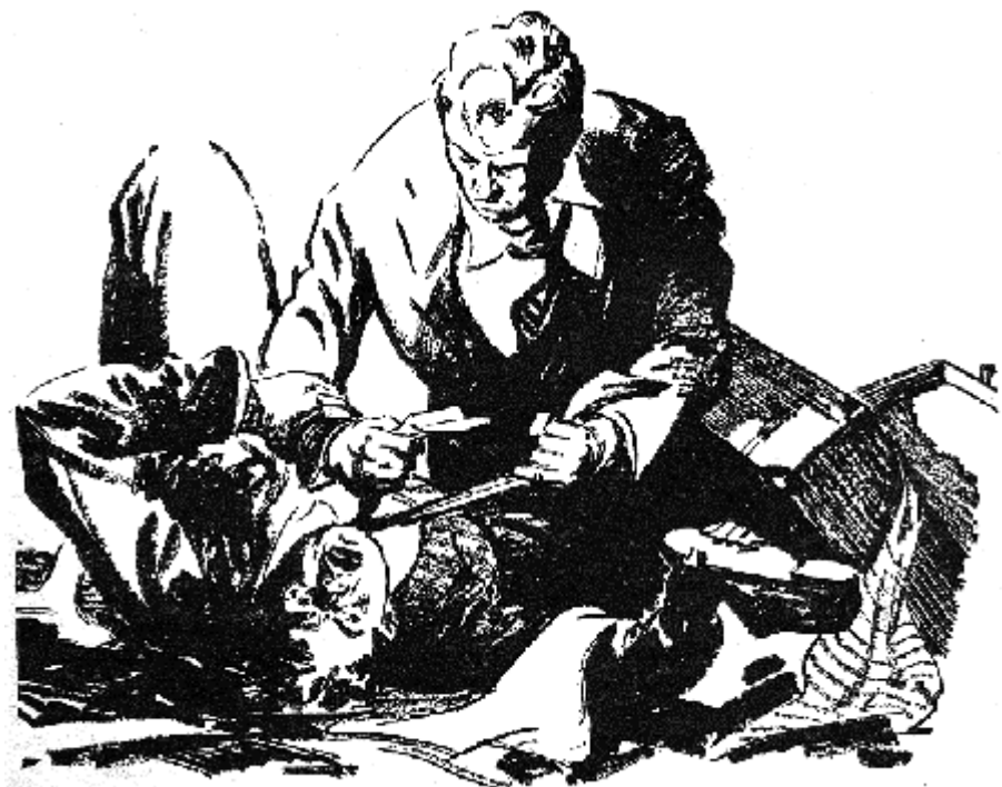
The man wrapped the necktie around Fancife's neck like a garrote cord!

surveyed his visitor. He did not immediately recognize the other.