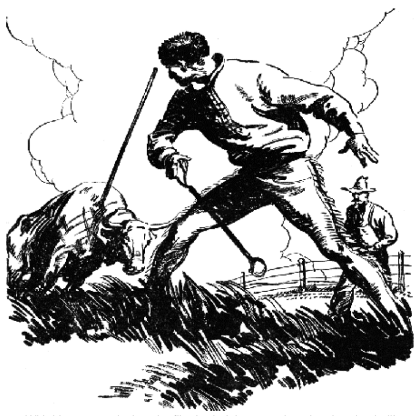
With his strange device, the flier hurled the spear into the charging bull!

They weren't cat hides, but something else, something incredible. A fur so luxurious, with such subtle coloring and quality, that the buyers were stunned. A man stepped forward, held one of the skins up and stroked it with his hand, and it was indeed as if a fabulous jewel were being shown. Fur men came to the spot, magnetized by such a fur as they hadn't dreamed existed.