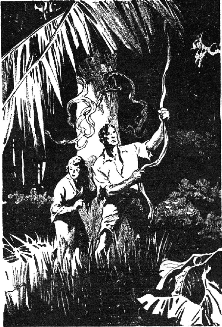
The bronze man tested the strength of the stout vine to see if it would hold Sanda and himself.

Doc Savage said nothing, having a hunch that the young woman's remark was a reflection on his jungle cooking. The previous evening they had dined on wacho parrot, which was tender when young.