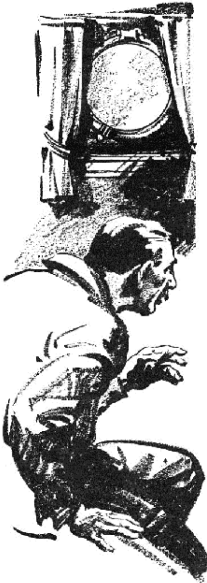
As Lord Dusterman looked on, the three men ganged up on Ham!

man was tethered to some object which made it impossible to get together to unfasten each other's bonds; Monk found that he was lashed to the footpost of the bunk.