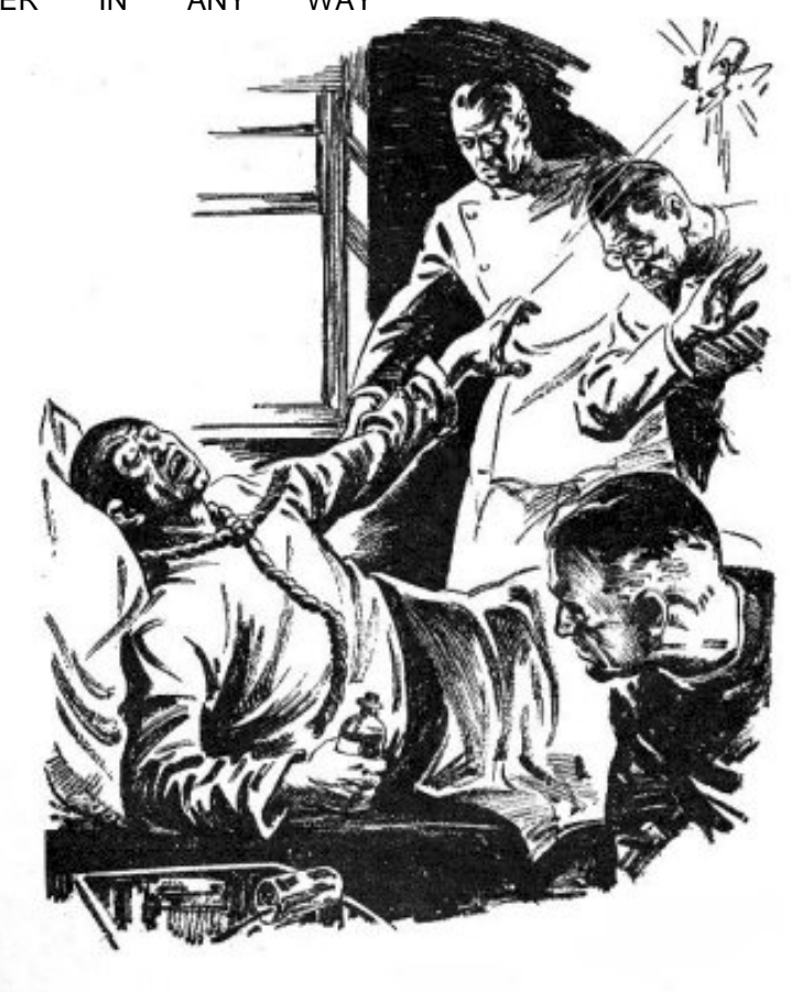
"I doubt he lives."

RESPONSIBLE FOR PRESENT CONDITION OF JEP DEE, AMERICAN GOVERNMENT IS GOING TO BE INTERESTED BECAUSE IT IS ALREADY NOT ON GOOD TERMS WITH PRESIDENT-DICTATOR OF BLANCA GRANDE.