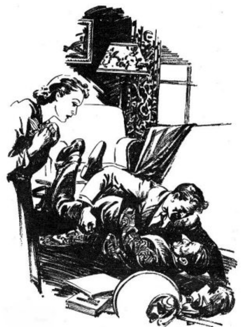
Tex and Peace hit the floor.

"I'm beginnin' to think you're gonna make a better daddy-in-law than I expected," he said.