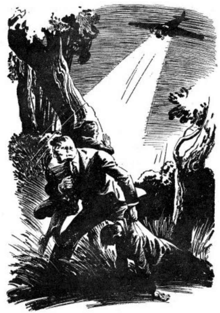
Peace grabbed his limp friends and ran for cover.

were level stretches, but not many. Henry Peace selected one.