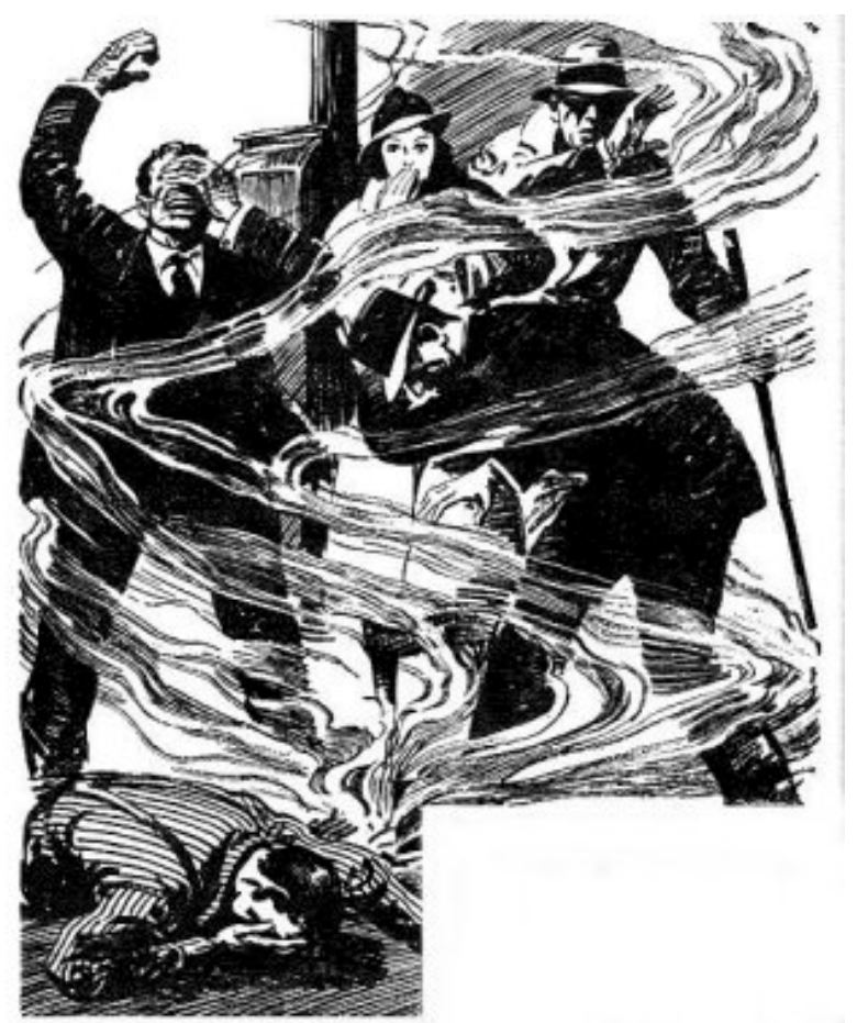
They ran in different directions, blindly, bumping into things.

Unfortunately, no one gave him the closer scrutiny.