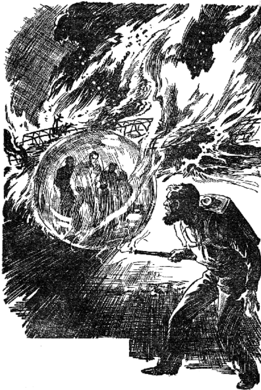
Doc and his men were inside what looked like a giant soap bubble. The bubble became a mass of foam, pressed the flames back.

The bronze man could have overtaken Even-Swap at any time. He made no attempt to do so. Instead, he loafed along. And he took care to keep concealed as much as possible.