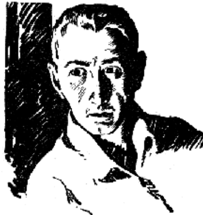
"Long Tom"—Thomas J. Roberts—is known as the "wizard of the juice"—is the electrical expert of Doc Savage's band of intrepid fighters. Small in stature, his brain holds an enormous amount of learning. It is he who furnishes the electrical equipment and radio devices that have done much to further the success of Doc Savage's triumphs over his enemies—men who wish to further their own ends at the expense and suffering of mankind.

A thin man with pallid, unhealthy-appearing complexion, stepped from the plane. He was not very tall, and seemed a physical weakling. That appearances were deceitful, those who had come in contact with Major Thomas J. Roberts knew to their sorrow.