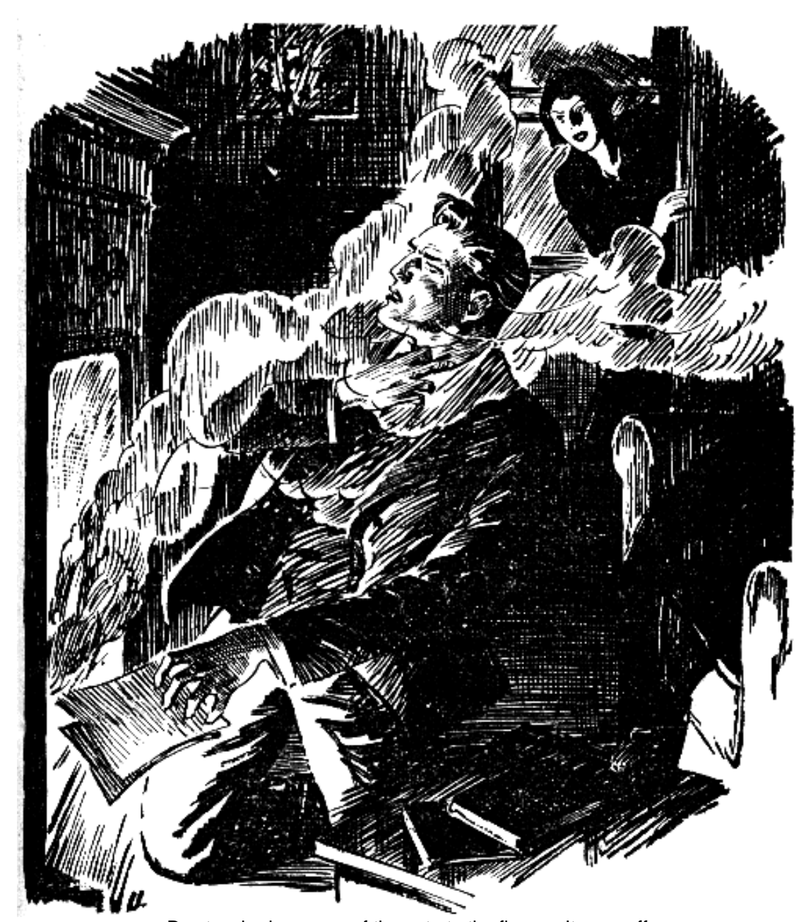
Doc touched a corner of the note to the flames. It gave off much smoke, which curled up around Doc's face.

"Oh!" choked a voice back of the window. "Oh!"