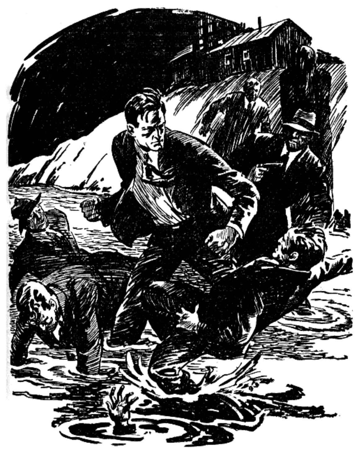
The thing became a mêlée. Fists hit Doc. He struck back.

The thing became a mêlée. Fists hit Doc. He struck back. Once a gun blew off so close to his face that his flake gold eyes were powder-burned.