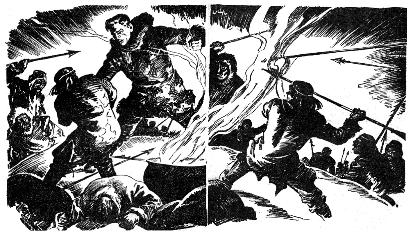
Cries of fear immediately changed into yells of menace. Lapps and Norwegians united in a rush.

The structure was composed of heavy timbers. There was only one massive door.