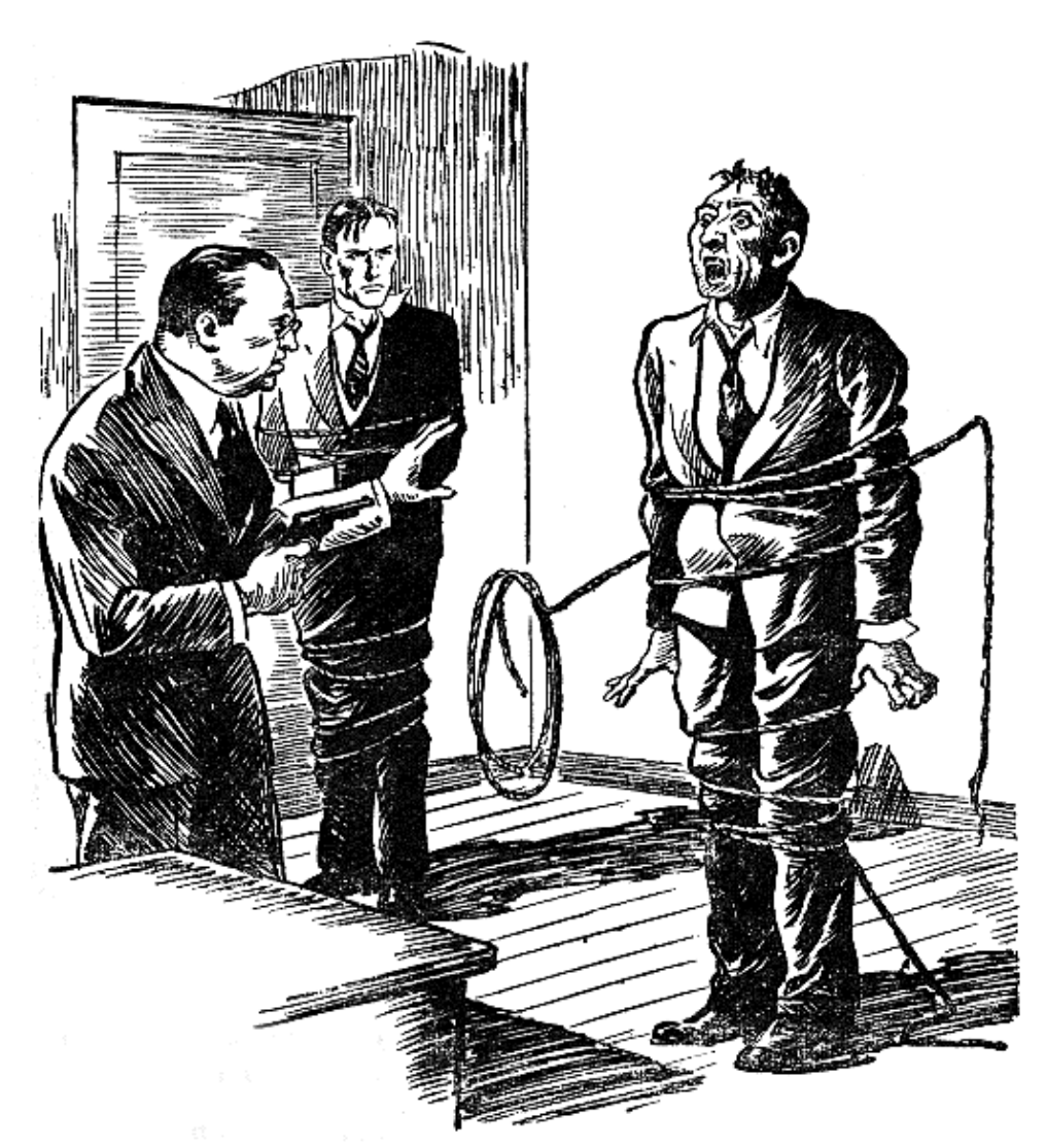
Ropes came snaking out of a pile in the corner and seemed to wrap themselves about Marikan. . . .

But Monk was ready for that. He had lunged to Telegraph's side, and as the gun came up, he struck the man's arm a terrific blow. Telegraph not only howled and dropped his weapon, but fell down as well.