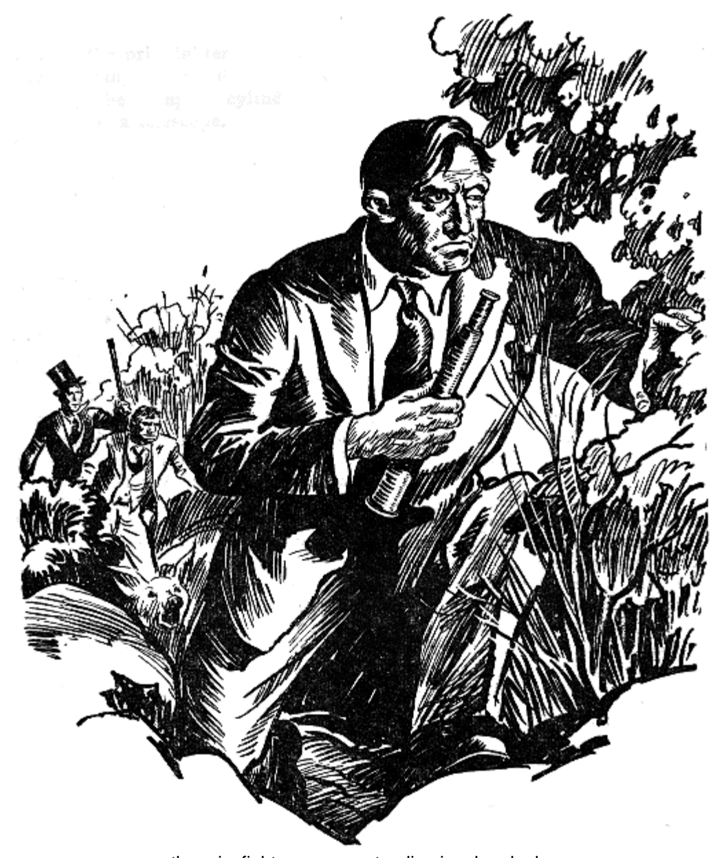
... the prizefighter ... was standing in a brush clump, holding the compact cylinder of a telescope.

"They discussed a man named Easeman and were very concerned over whether or not he was dead," said the big man. "They also did some conversing by a system of signaling on their hands. It must have been a system of their own, a sort of shorthand by gestures. There was not a movement for each letter of the alphabet, but motions which evidently meant whole phrases or sentences. Unfortunately, I failed to make out much of it."